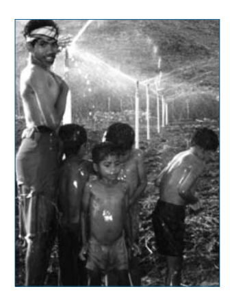
Water impacts people's daily lives in a myriad of ways.

OMEWHERE on earth, a mother awakens before dawn to collect water, prepare breakfast, and begin the day's chores. A thousand miles away, a textile factory churns out the day's production, and hundreds of workers come and go from the informal settlements where they live. Elsewhere, a farmer tills her field and hopes for rain, while another opens an irrigation valve to water his thirsty crops. A hotel developer plans a new beach resort as the village fisherman prepares his nets for the day's catch. Each day around the world, millions of such individuals, families, and businesses engage in myriad acts of water resources use and management, with a mixed set of outcomes for the planet and each other.