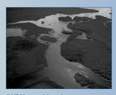
IWRM considers impacts beyond a single activity.

IN practice, the realization of integrated sustainable development and IWRM can only be achieved by numerous specific actions of individuals, communities, businesses, and governments. IWRM is a laudable ideal that must fit with the reality faced by Missions struggling to meet multiple development objectives—often with shrinking budgets. The USAID Water Team is ready to support projects at all