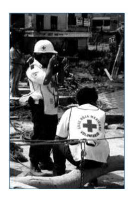
Risks and Disaster Management: Hurricanes, tornadoes, floods, and droughts cost many thousands of lives and many billions of dollars each year. The marine systems that cover three-quarters of the earth's surface are vital drivers of meteorological and hydrological cycles, with implications for the physical safety of millions of people who suffer from droughts and floods annually. Changes in land use, such as urbanization or the clearing of forests, can reduce water quality and threaten human populations by exacerbating the impacts of seasonal flooding and drought. Global climate change may increase the variability and unpredictability of weather patterns and extreme events. Losses can be mitigated by planning. sound development, monitoring, and preparedness.