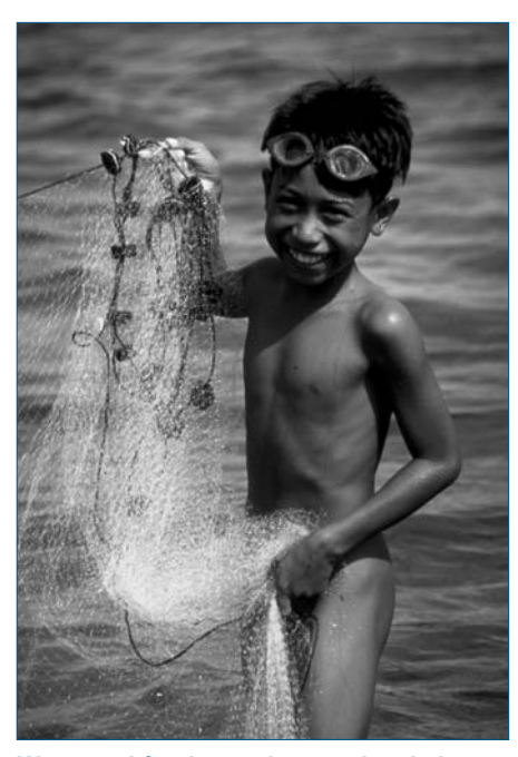
Water and food security are closely intertwined.

mental linkages among them or the enormous ripple effects that can occur upstream and downstream. As we guide our human activities—for all social groups, in all use sectors, and across multiple spatial scales—our challenge is to keep in mind the image of the single Blue Planet as a guiding principle for a more integrated and holistic relationship with fresh and marine water resources. This can inspire creative solutions and can transform our relationship with water in profound and lasting ways.