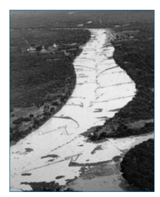
Fishing nets clog a river.

How to move from sectoral management of the resource to a more integrated approach remains a challenge everywhere, including within the Agency. USAID has already had some good results in this area and is continually expanding its toolbox of valuable resources, information, and guidance to support practical, step-wise approaches to enhance integration in both current and new activities.