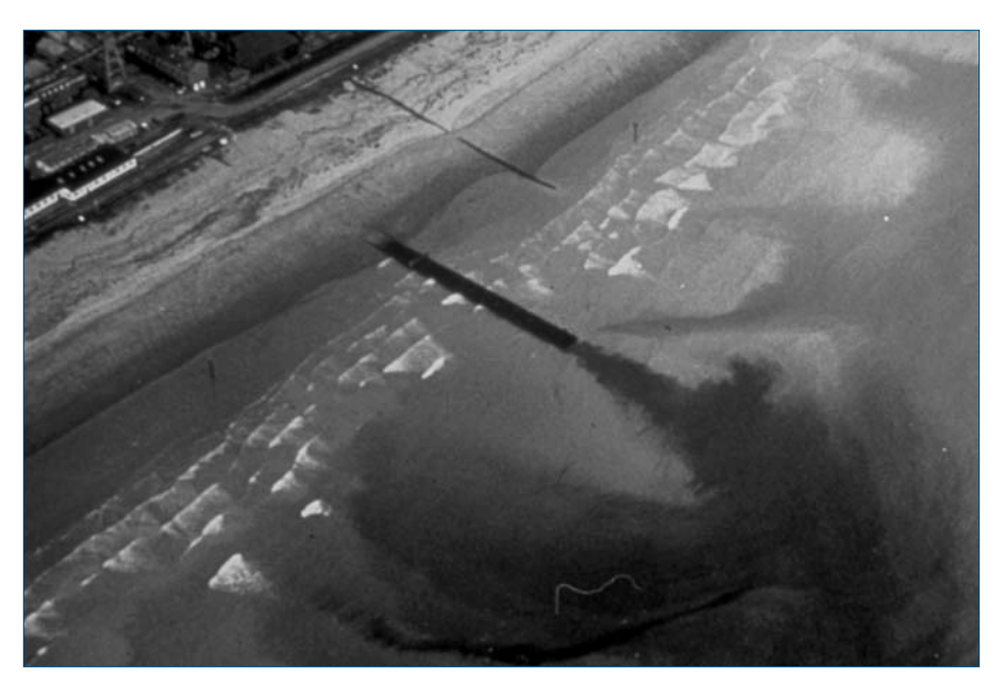
Economic productivity impacts water resources.

Historically, USAID has directed substantial resources toward various aspects of water resources management, reaching a total of at least $11 billion over the last 30 years, and well over $400 million annually in recent years. Many extremely valuable investments have been made to improve access to safe and adequate water supply and sanitation, improve irrigation technology, enhance natural environments, and develop better institutional capacity for water resources management in countries around the world. The way in which these programs have been designed and implemented has often been along traditional sectoral lines: agriculture/irrigation, public health/water supply and sanitation, urban development, economic development, habitat protection and biodiversity. While integration has certainly occurred in specific cases, it is only in recent years that the Agency has explicitly attempted to build bridges across different sectors working in the area of water resources management. A practicable form of IWRM is being promoted to permit synergies and achieve more effective, efficient, and lasting outcomes. In short, USAID is striving to become more strategic in how it manages its investment in the area of water resources management.