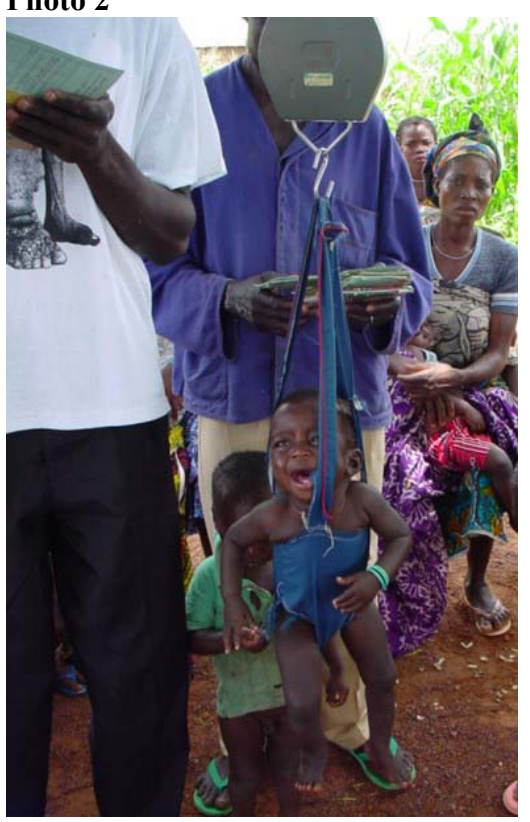
Photo of a baby being weighed during a Food-Assisted Child Survival clinic in the Bongbini community. The women participating receive a take-home ration of food when they are pregnant and after the baby is born until the infant reaches six months of age. (Photo taken July 22, 2003)