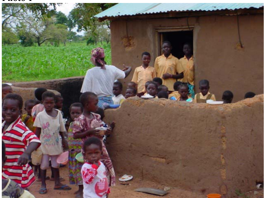
Photo of Langbinsi preschool children receiving their school lunch through the Catholic Relief Services school-feeding program. (Photograph taken July 22, 2003)