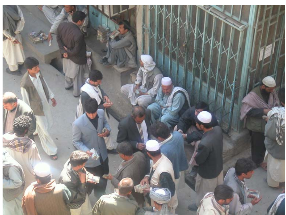
Photograph of currency traders, referred to as the hawala , who operate in an informal, unregulated setting. These traders also provide services such as money transfers. (Kabul, Afghanistan, March 2004)