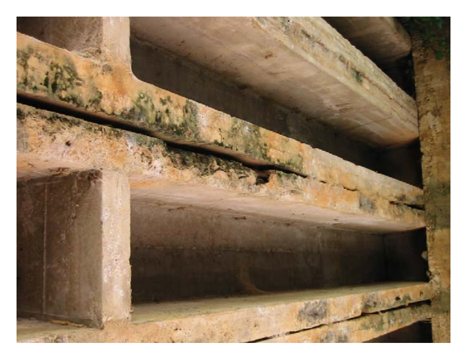
Figure 2 – Photograph of concrete beams with corroded steel strands and filtered-down moisture below Los Achiotes bridge in Olancho, Honduras, September 2003

Zopilote bridge presented several types of damage that could reduce its useful life. The concrete slabs on the deck of the bridge were separated. (See Figure 3 below.) As with Los Achiotes bridge, the steel in the reinforcing bars was exposed<sup>20</sup> and presented signs of corrosion, which could rapidly reduce the strength of the steel and the load carrying capacity of the beams. Last, water filtered down through the deck, and the concrete beams showed evidence of minor leakage. The civil engineer estimated that this bridge could last for four more years, until the end of the year 2007.<sup>21</sup>