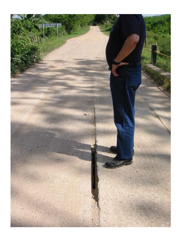
Figure 3 - Photograph of separated concrete slabs on the deck of Zopilote bridge in Olancho, Honduras, September 2003

For both Los Achiotes and Zopilote bridges, the civil engineer stated that the main causes for the bridges not being in adequate condition were construction deficiencies and low quality of materials used, while the secondary cause was the lack of preventive maintenance. The civil engineer stated that corrective actions must be taken as soon as possible to prevent further damage. He specifically mentioned that repairs should be completed by May 2004, before the rainy season begins in Olancho.