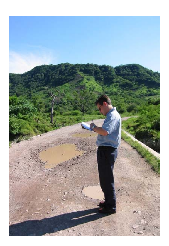
Figure 1 - Photograph of auditor assessing road condition on Road #210, Choluteca, Honduras, September 2003

Roads were evaluated based on both critical and noncritical factors. The critical elements consisted of: 1) the existence of potholes (see Figure 1); 2) the leveling of the surface camber (arched surface); 3) the presence of corrugations;<sup>5</sup> 4) the existence of erosion channels on the roadway, shoulders or ditch slopes; and 5) the adequacy of road drainage. Noncritical elements<sup>6</sup> include the condition of culverts (drains under roads), the presence of vegetation in road shoulders, and the proper compression of pothole filling material. To determine that a road was not in adequate condition, three or more critical elements had to be rated negatively.<sup>7</sup> An independent civil engineer, under contract with the Regional Inspector General/San Salvador, agreed that the above criteria were appropriate to determine whether roads were in adequate condition.