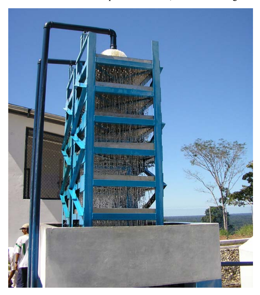
Photograph of Cascales water aeration tower taken in June 2004.

While the monthly water fees were sufficient to pay for the on-going operation and maintenance of the water and sewer systems we observed, the fees were not adequate to build up a reserve sufficient to pay for major capital expenses. Three water boards had built up a cash balance in excess of $1,000, but most of the other water boards had balances less than $200. Even the least expensive water system we visited cost several thousand dollars, and it is therefore probable that most of the water boards will not be able to pay for major capital repairs or expansions. We are not making a recommendation because we believe that, for the purposes of the Northern Border Development Program, achieving operational sustainability was sufficient. The program's goal was for the water systems to be sustainable on an operational basis, and it met this goal.