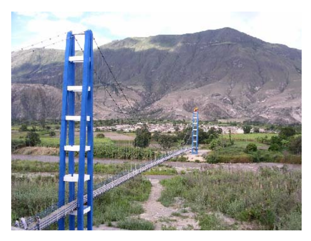
Photograph of Chota River pedestrian bridge in the Province of Carchi taken in June 2004.

Roads and bridges – USAID/Ecuador spent approximately $4.3 million building and rehabilitating roads and bridges in the northern provinces of Ecuador. Most of the road funds were spent rehabilitating a 52.2 mile unpaved road between Trufiño and Quinshull near the Colombian border in the Province of Carchi. Eight vehicular bridges and 13 pedestrian bridges were constructed through the end of 2003. As of March 31, 2004, contracts had been issued for work on an additional seven bridges.