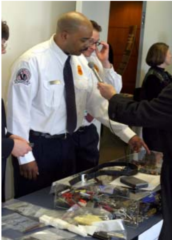
Transportation Security Administration workers display contraband seized from passengers at Midway Airport. More than 200 items represented a single weekend's seizures.