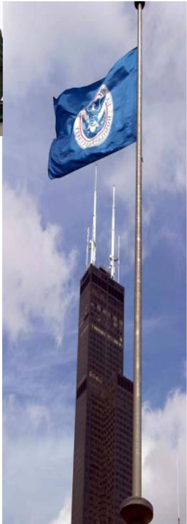
(BELOW) DHS flag flies atop U.S. Customs building with Chicago's Sears Tower in the background.