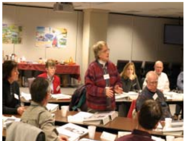
Environmental and Historic Compliance course attracted students from throughout the country.

Thirty-one students attended the course from several FEMA regions including Regions I, VI, and X. The Wisconsin Department of Emergency Management was also represented. The class consisted of three days of classroom participation and was instructed by staff from FEMA Headquarters and Regions I and V.