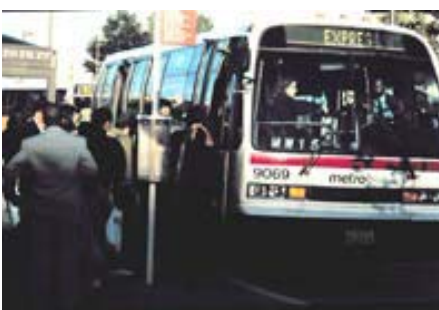
• Washington Dulles International Airport

To find more information, please go to: http://www.wmata.com/timetables/dc/ 5a.pdf