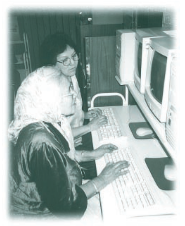
Learning computer keyboard skills

In 1998, the BIA began an assessment of its deferred maintenance on a nationwide basis. It was found that over $8.8 billion was required to meet the maintenance needs of its buildings, schools, detention centers, roads, and bridges. This is in sharp contrast to the $359.5 million appropriated to BIA in 1998 for these maintenance needs.