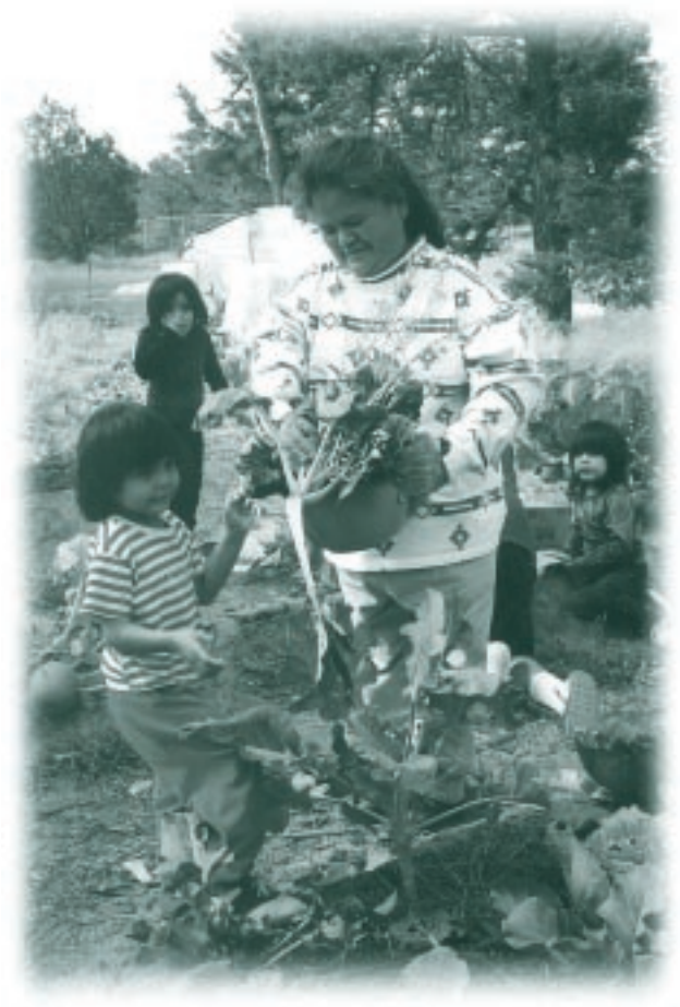
Harvesting greens in a bioitensive demonstration garden

The BIA provides financial assistance to American Indian Tribes, Alaska Natives, and individuals for the establishment, acquisition, or expansion of business enterprises on or near American Indian reservations, or land held by Alaska Natives incorporated under the provisions of the Alaska Native Claims Settlement Act, as amended. This financial assistance helps Tribes, corporations, and individuals achieve greater economic self-sufficiency in their communities and expands employment opportunities for tribal members and Alaska Natives. Financial assistance is made available through the Indian Loan Guaranty Program as authorized by the Indian Financing Act of 1974 (P.L. 93-262), as amended.