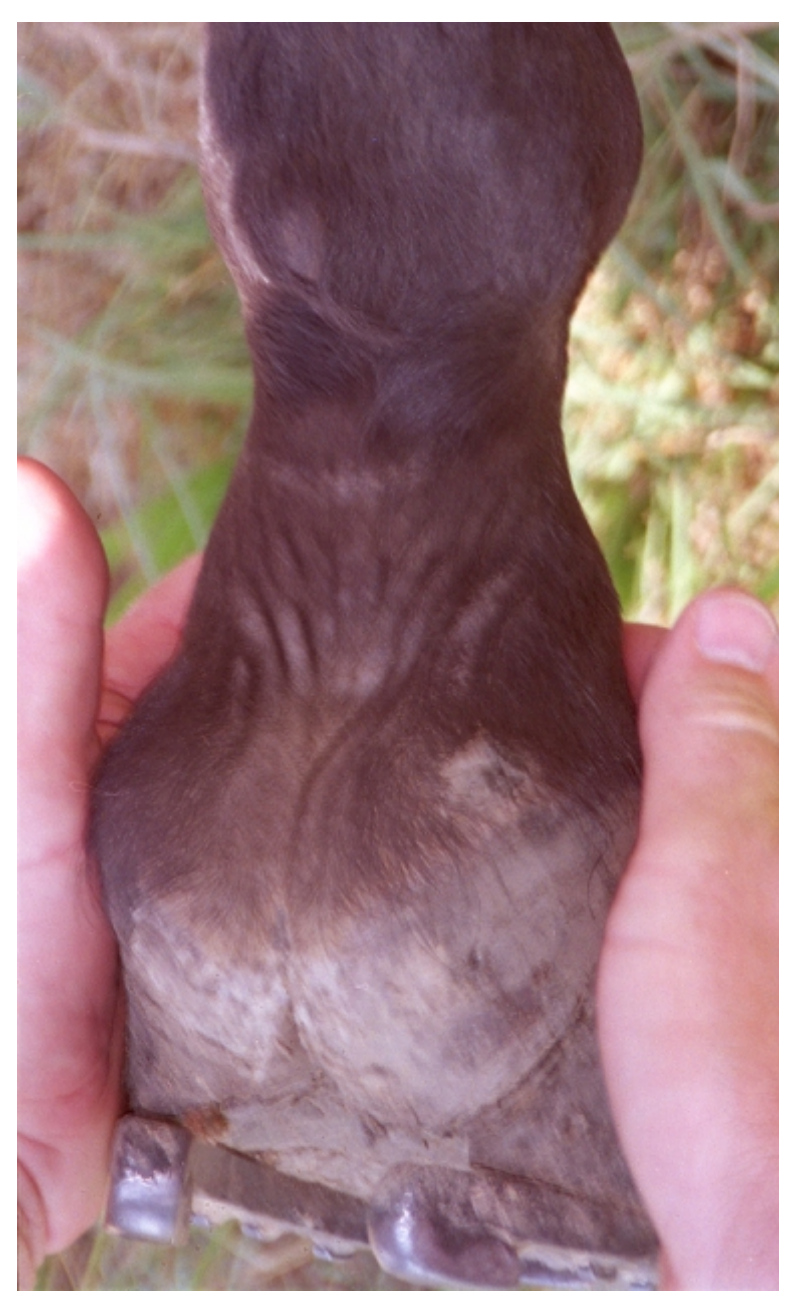
Figure 7 —A small amount of folding of the skin exists on the back of the pastern. This may not be a violation if the skin can be determined to be uniformly thickened. (See fig. 8.)