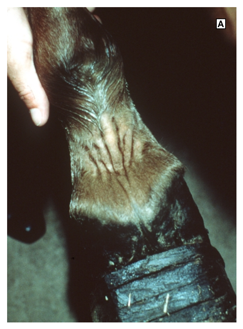
Figure 11A and B —The skin does not appear to be uniformly thickened. There are ridges and furrows present. If these can be smoothed out with the thumbs (see fig. 8), these would not be violations.