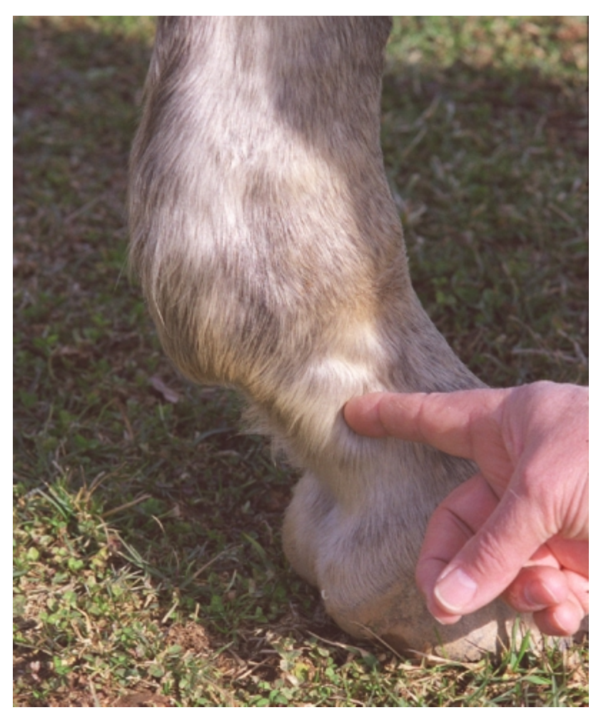
Figure 2 —Another method uses the neurovascular bundle (NVB) to determine if a scar is in an unacceptable location on the pastern.

• Neurovascular bundle (NVB) method. The NVB is a group of veins, arteries, and nerves that run down the sides of the pastern. It can be located by finding the back surface of the pastern bone and then placing the upper surface of the nail of your index finger against the back surface of the bone. The fleshy part of the index finger is now covering the NVB. Any scarring or uniformly thickened skin covered by or extending forward from the finger indicates a violation of the scar rule (fig. 2).