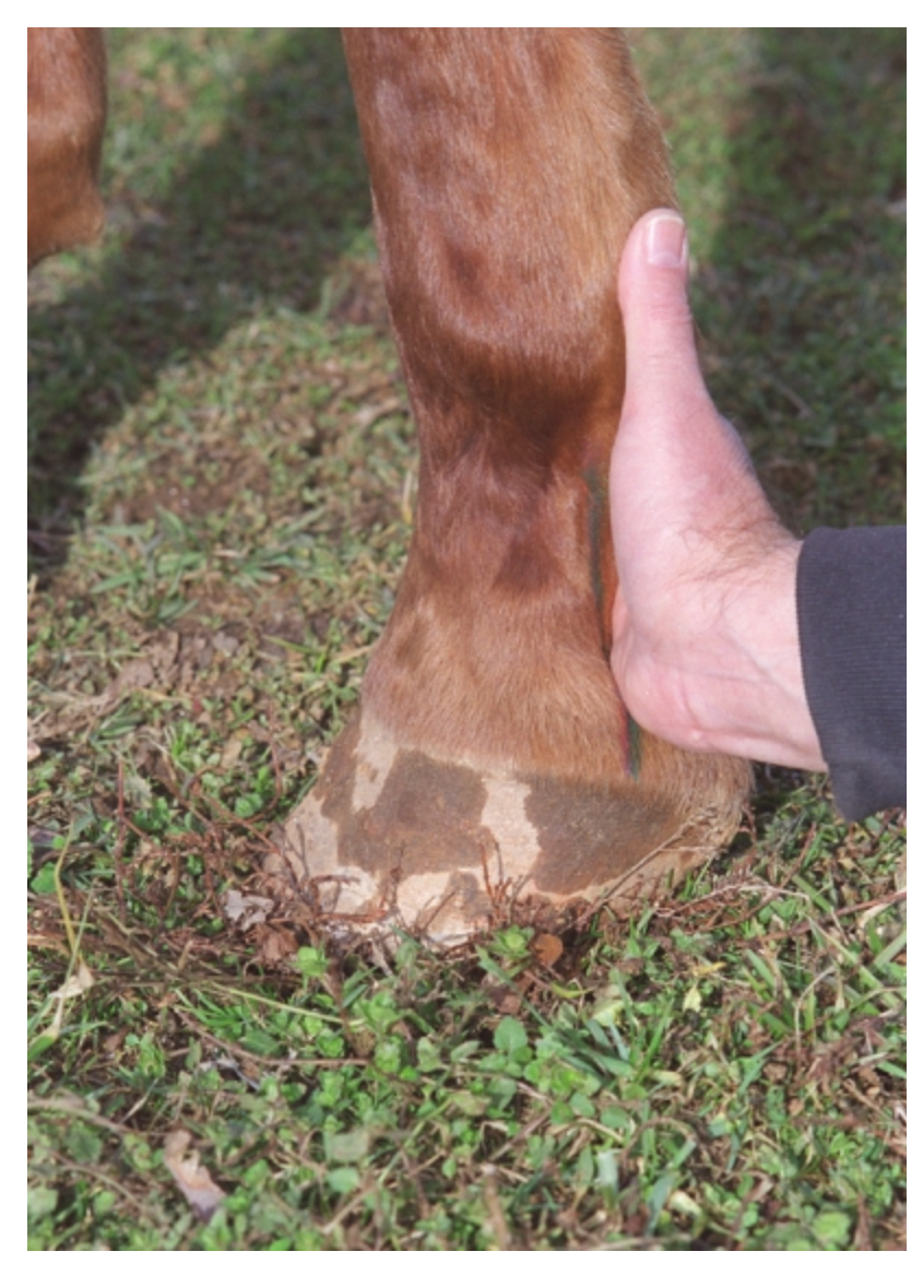
Figure 1 —The flattened-hand screening method is one way to determine if a scar is on an anterior or posterior surface of a horse's pastern.