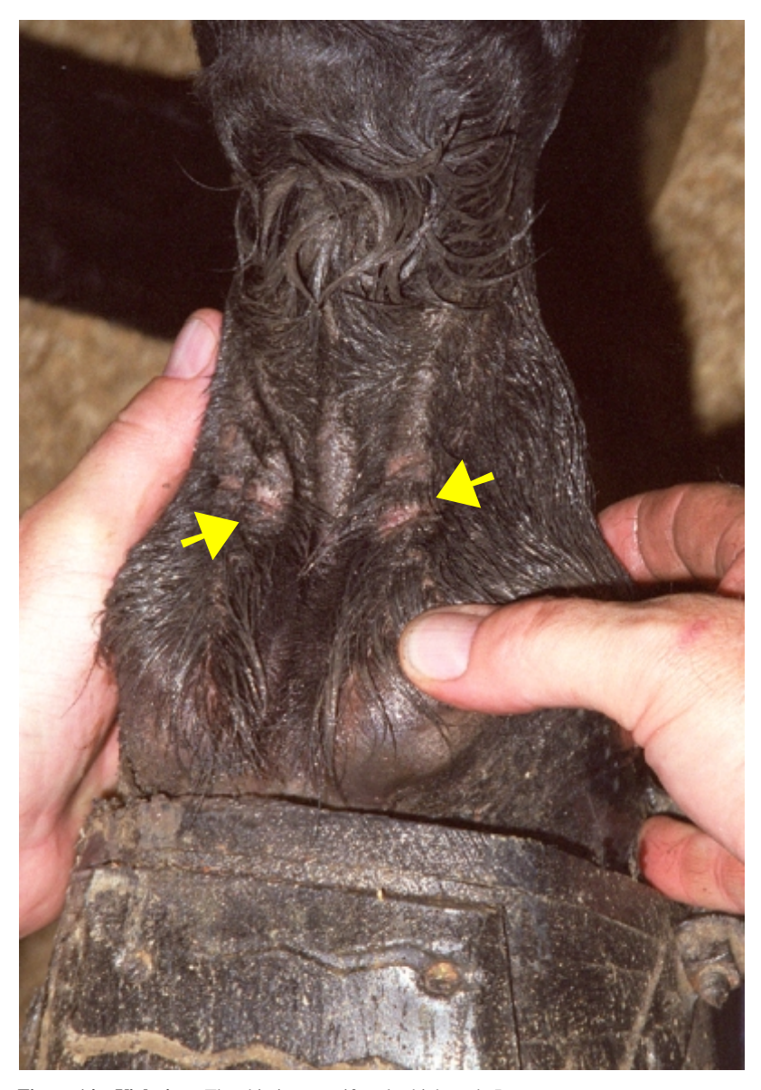
Figure 14—Violation. The skin is not uniformly thickened. It is folded into ridges and furrows with evidence of swelling and redness. The arrows point to red and swollen areas.