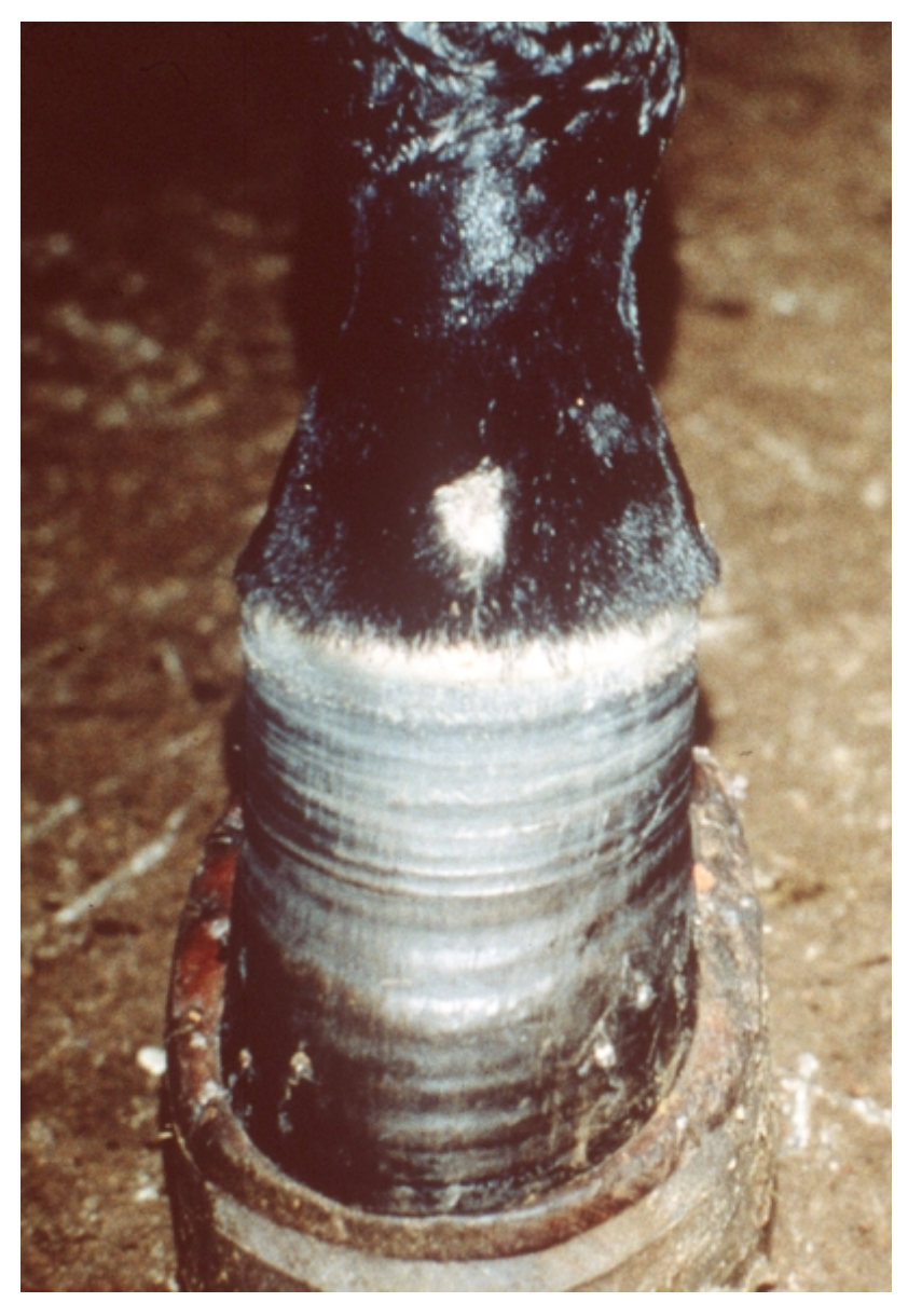
Figure 6 —Violation. Scarring is present on the anterior surface (front) of a front leg pastern.