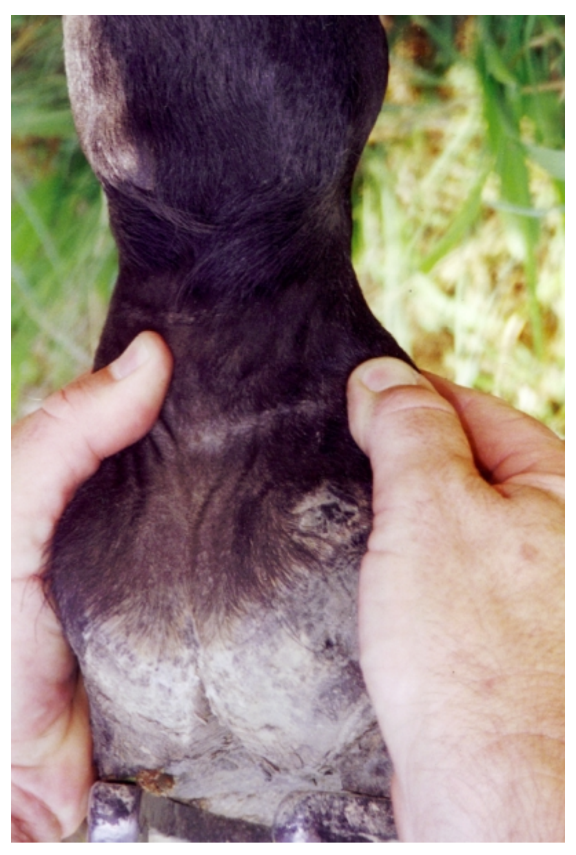
Figure 8 —Spreading of the skin with the thumbs shows that the folds of skin can be smoothed out, indicating the skin is uniformly thickened. This is not a violation.