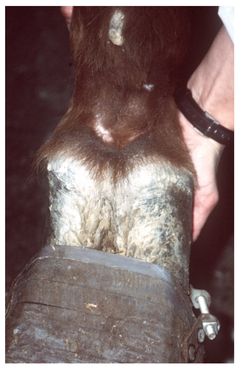
\begin{tabular}{ll} \textbf{Figure 5} \end{tabular} \begin{tabular}{ll} \textbf{No violation.} & \textbf{Only mild hair loss is apparent on the posterior (back) surface of the pastern.} \end{tabular}