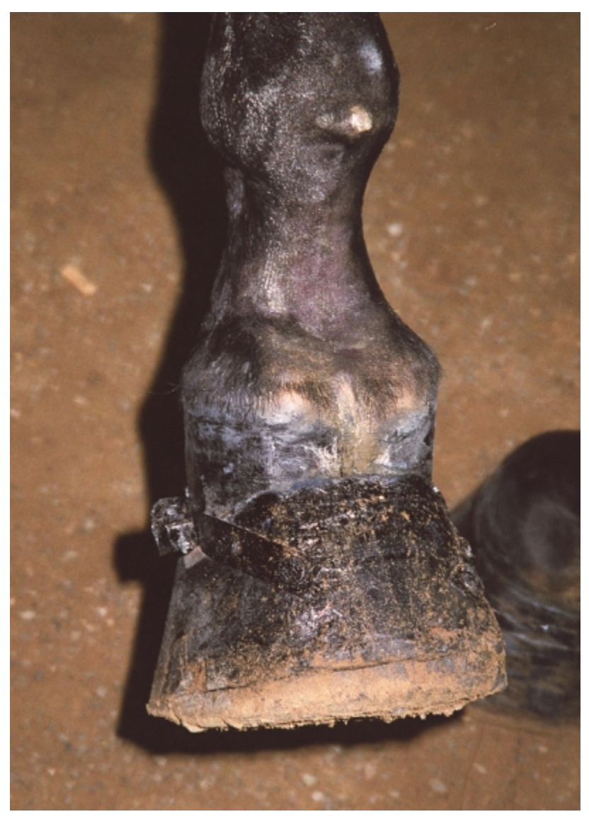
\label{eq:Figure 4-No violation. This is a normal pastern. There is no scarring present.