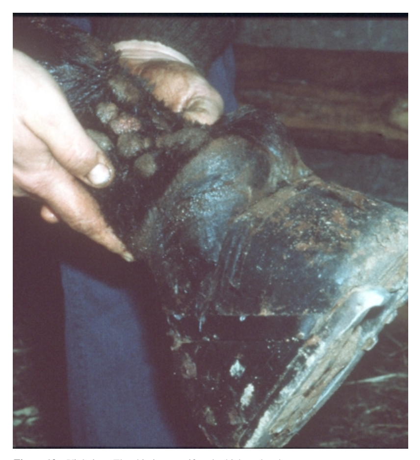
Figure 13—Violation. The skin is not uniformly thickened and shows signs of inflammation. There are a number of masses of scar tissue (button lesions) present. Note that the mass in the center appears to consist of reddened, inflamed granulation tissue. There is also a significant amount of hair loss.