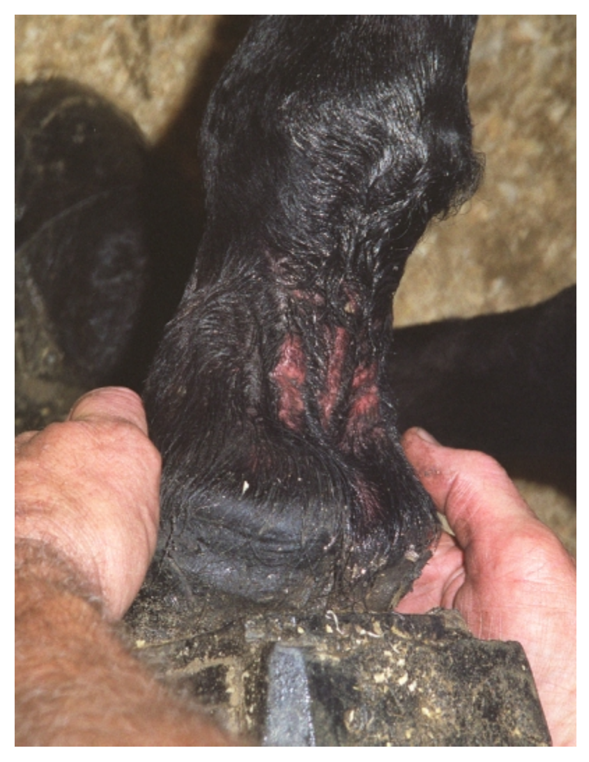
Figure 15 —Violation. While the skin may be uniformly thickened, there are signs of inflammation, redness, and swelling present.