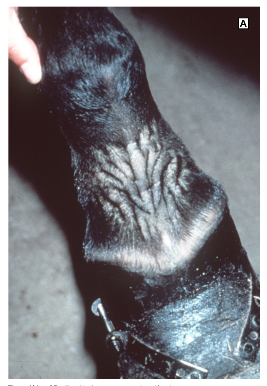
Figure 12A and B —The skin does not appear to be uniformly thickened. Ridges, corrugations, furrows, and some hair loss are present. These would be violations if the skin cannot be smoothed with the thumbs (see fig. 8).