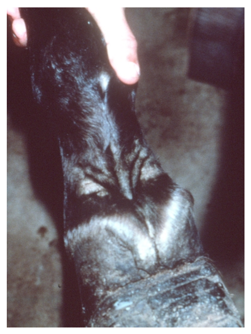
\label{eq:Figure 10} \textbf{Figure 10} \textbf{--} \mbox{Violation. Nonuniformly thickened skin has ridges, deep furrows, and nodules.}