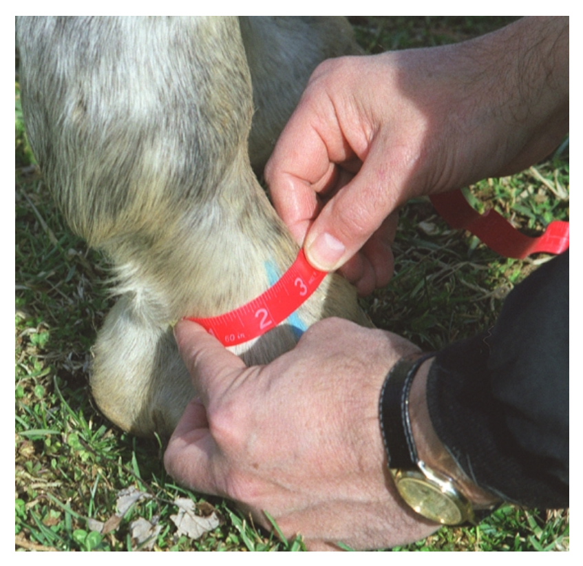
Figure 3 —When the flattened-hand or NVB method is not sufficient to make a determination, circumferential measurements may be used.

• Circumferential measurement. This method is used as the deciding method if the other two do not provide an absolute answer. The circumferential measurement requires the use of a measuring tape and a chart to analyze the results (fig. 3). It is a more complicated procedure. If you are interested in knowing more about this procedure, please contact USDA—APHIS Animal Care or a Horse Industry Organization (HIO) for further information.