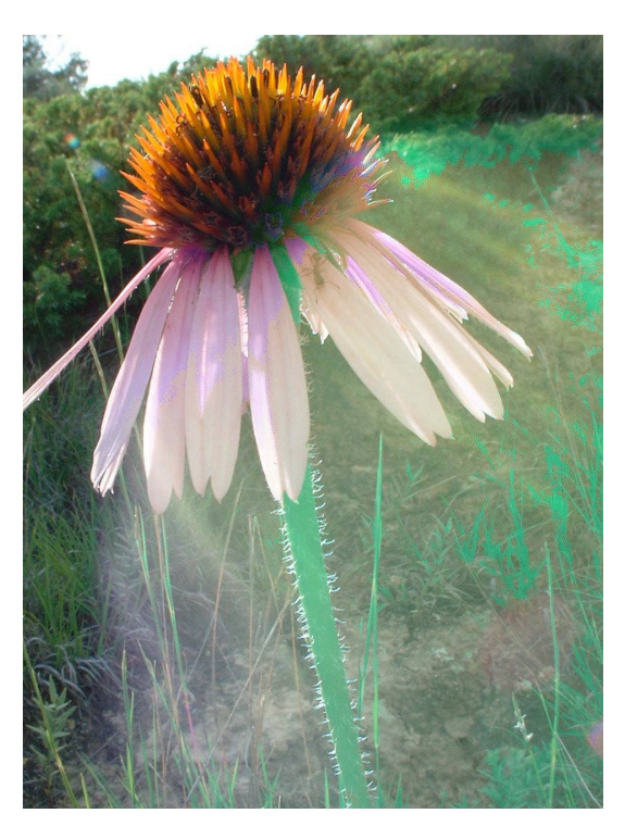
Purple Coneflower in the sunlight

Also plentiful in the summer is purple coneflower or Echinacea. This sturdy pink-flowered plant is a member of the Aster family and is known locally as