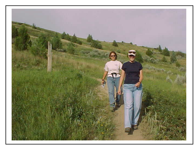
Hiking near Andrews Creek on the MDHT

Want to make it a round-trip? Between milemarkers 3 and 4 follow the two-track road east to the Medora Musical Parking Lot, down past the Chateau, and back into Medora. All the adventure; half the time!