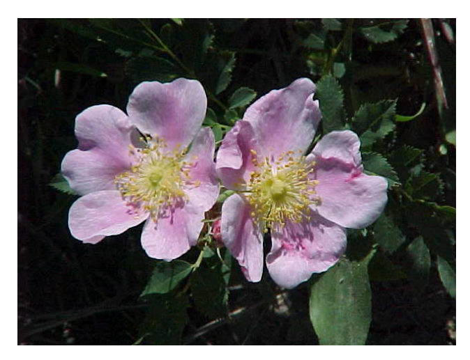
Prairie Rose, blooming along the MDHT

In drier, sandy sites, you may come across the fuchsia bloom of a ball cactus. Bees are attracted to their pollen-laden blossoms.