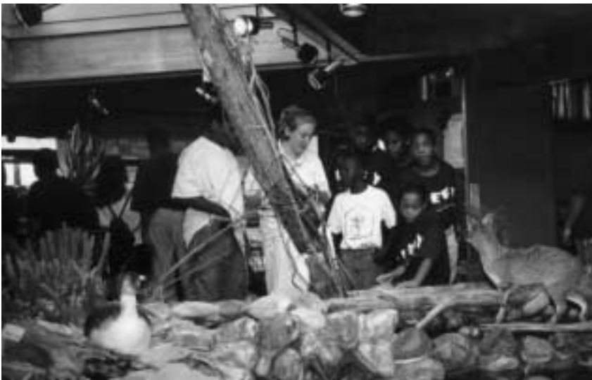
D.C. DEFY youth learn about nature at the Point Lookout Wildlife Center in Maryland.

In January 2001, 14 DEFY youth participated in the first annual D.C. DEFY Essay and Poster Contest, which was organized by the DEFY Parents Club. The youth wrote essays and created posters based on the theme, "What DEFY Means to Me." Many contestants expressed their appreciation for the time that DEFY mentors have given them over the past few months. Each participant received a trophy and/or certificate for his or her work. Some of the youth's artwork will be published in the next edition of Hill Rag , a local newspaper that serves Capitol Hill and Northeast Washington, D.C. (continued on next page)