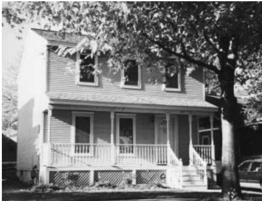
A new home on Green Street built by Weed and Seed partner Northeast Hawley Development Association.

Working with landlords has become an important piece of the effort in Syracuse. The Landlord Training Program, developed in conjunction with the city of Syracuse and Campbell DeLong Resources, was critical to educating landlords in the area. The approach used to target landlords was relatively easy and extremely effective in ensuring that an effort was made