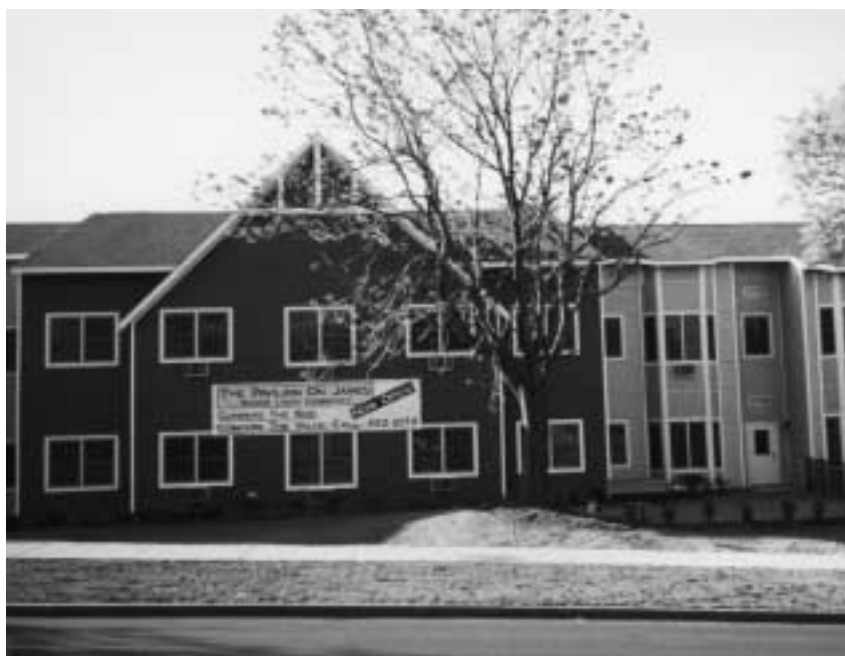
The Pavilion on James, an $8.5 million facility, was built by a company that decided to invest in the corridor because of significant improvements made on the street.

residents of the target area. Through efforts with the Onondaga County Department of Social Services, the county has developed an important housing initiative. Social services recipients no longer dwell in substandard housing, landlords do not receive rent for unacceptable units, and tenants are held accountable for any poor housing behaviors. In addition, collaborative efforts with the city's code enforcement division and police department and the county's health department seek to improve the quality of housing for renters in Syracuse.