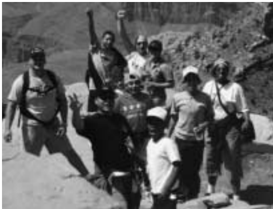
DEFY youth and their mentors hike the Grand Canyon on the "Southwest Meets Midwest" DEFY Trip.

When the Tucson/South Tucson group planned its Phase II activities for 2000-01, staff wanted to include a trip to the Grand Canyon in the program. It became an important part of the year's planning. Youth and adults alike started to attend more DEFY meetings and activities just so they could ensure their places on the trip. Early in the year, Tucson DEFY program planners tried to recruit other DEFY sites to join their group for a trip to the Grand Canyon because they believed that exposing the youth to a different group of campers would be exciting. However, the dates didn't work out for other sites.