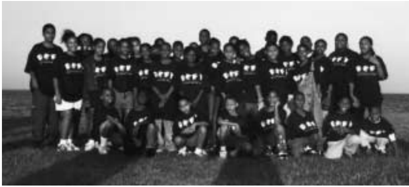
D.C. DEFY youth enjoy each other's company at Camp Riverview in Scotland, Maryland.