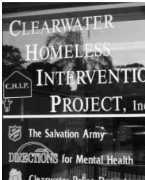
CHIP's mission is to teach people about compassion, respect, and responsibility.

To increase the likelihood of a client's success, each person is required to take responsibility for his or her own actions. CHIP fully expects its clients to contribute to their own well-being and take positive steps toward solving their problems. In its broadest context, CHIP helps homeless people access services around town and challenges them—through partnership with the local police department—to respect the rights of others and to conduct themselves in a responsible manner while they are on the streets. CHIP also challenges the community to support the program by providing CHIP and its clients with financial support, resource development, jobs, and decent and affordable housing. 🏠