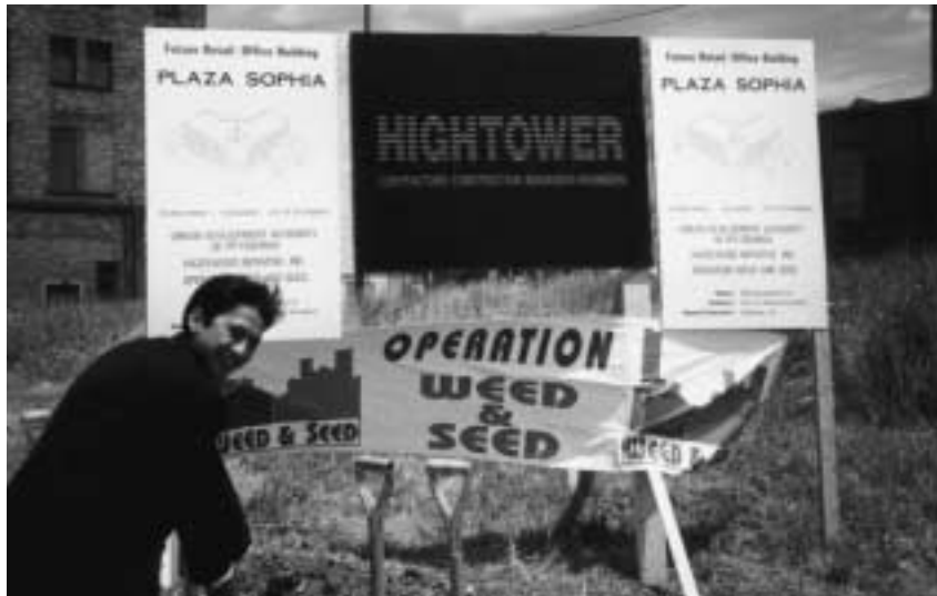
Hazelwood (Pittsburgh) Weed and Seed's strategy is supported by a strong neighborhood revitalization plan.

In-Sites is looking for stories from the field that provide details on how abandoned properties were turned into housing opportunities for neighborhood residents. These properties may include Brownfields projects, initiatives funded through Community Development Block Grants, and areas that used community Individual Development Accounts. If you have any questions, please call the In-Sites desk at 202-514-0709. E-mail your stories, comments, or other input to soltysik@ojp.usdoj.gov . 🏠