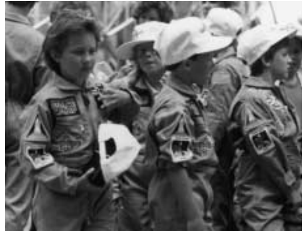
The Young Astronaut Council helps children in Weed and Seed sites learn to understand their world and beyond.

Like other groups across the Nation, participating Weed and Seed sites use the Young Astronaut Council's curriculum, Mission: Science , to explore space-related topics through hands-on activities. Mission: Science incorporates the latest science education standards and