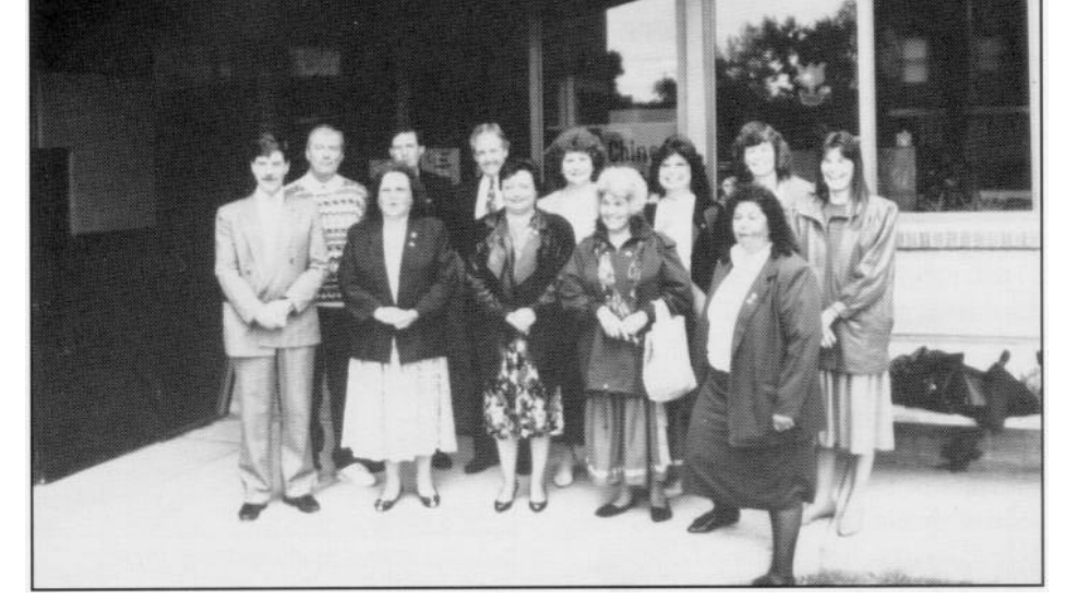
The Healing Lodge Planning Committee, a unique partnership composed of Aboriginal women, native elders, and Correctional Service of Canada staff.

In October 1990, the Commissioner of Corrections announced the creation of a National Implementation Committee to oversee the initiative—including all