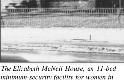
minimum-security facility for women in Kingston, Ontario, opened in March 1990.

3. Establish a Healing Lodge, which would serve as an incarceration option for Federally sentenced Aboriginal women.