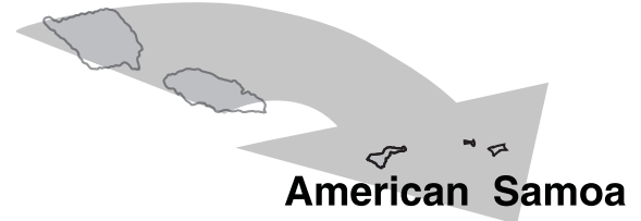
Figure 2. Marijuana smuggling route.