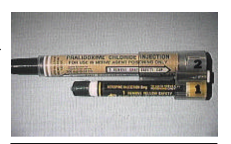
Mark I Nerve Agent Antidote Kit

The only military chemical warfare agents with a specific antidote kit are the nerve agent series. Autoinjectors of atropine and 2-PAM chloride make up the components of the MARK I Nerve Agent Antidote Kit. These kits are a controlled medical item, have a limited shelf life and strict security and storage requirements, and can only be administered by certain levels of medical personnel. To be useful to anyone exposed to a lethal dose of nerve agent, they must be administered within seconds to minutes after exposure.