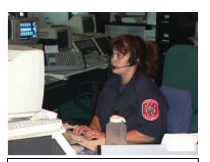
9-1-1 Operators provide the communication link between victims on the scene and emergency responders.

Although dispatchers gather valuable information and update responders, they are generally not decision makers. The dispatch center often takes a supportive reactive role by responding to the requests of the IC during disaster events, versus disseminating information into intelligence, which is left to the IC. Thus, initial command and control of a CW incident should start with the dispatch center, but often are left to those who respond to the scene. The role of the dispatch center during a CW incident will become more prominent as the incident escalates. Like all disasters, the dispatcher will need to maintain control of multiple radio