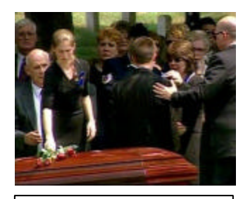
Only under extreme circumstances is it expected that remains will not be returned to families.

Determining the final disposition of remains may be a complicated process when there are a large number of remains to process or when contamination persists even after decontamination. It is important to note that the CWIRP Mass Fatality Management Working Group operated with one principle in mind: the effort to return remains to family members far outweighs procedural simplicity and that only under extreme circumstances should remains be withheld from family members.