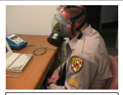
Mask fit requirements present a major challenge to departments; however compliance is essential to officer safety.

Occupational Safety and Health Administration (OSHA) respiratory requirements have been mostly overlooked when dealing with riot control masks. Results of this can lead to an improperly fitted mask or a poorly trained officer. In a riot control situation this may pose an inconvenience only to