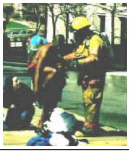
Disrobing provides approximately 80 percent of agent removal during decontam-

After emergency triage and prioritization of casualties, the first step of decontamination is to remove as much clothing as the casualties will allow. Studies indicate that up to 80 percent of the contamination on a victim will be removed by disrobing. Convincing the populace to do so will be a challenge to responders. It is also essential that the responders provide as much privacy and gender segregation as possible based on the resources available and amount of agent exposure to the victims.