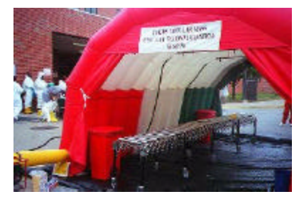
Hospitals need to be prepared to execute mass-casualty decontamination with their internal assets.

Presently, most hospitals generally do not have a decontamination area or PPE to prevent cross-contamination or the experience to perform mass-casualty decontamination.