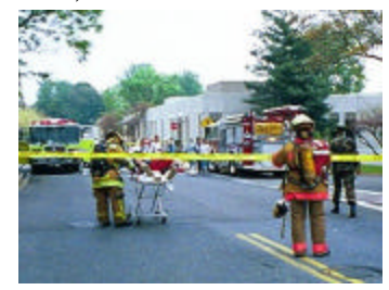
Rapid identification, marking, and enforcement of hazard zones are essential to protection of lives.

HazMat teams should be prepared to provide monitoring assistance to law enforcement to reduce the size of the outer scene perimeter. This reduction will free up additional officers to assist with security inside the Warm Zone as well as perform investigative duties.