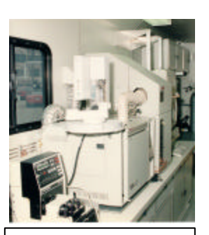
Low-level monitoring will most likely only be available through federal response agencies.

It is important that supervisors know that thorough (low-level) monitoring is resource-intensive costly and time consuming. Although the resources will most likely be made available through federal agencies, departments may have to operate without their equipment for a considerable period of time (several days or more, depending on the amount of equipment requiring monitoring and