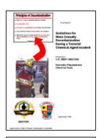
The Mass Casualty Decontamination Report is one of several studies documented by the CWIRP to assist responders in preparing for domestic chemical terrorism.

A third report, titled Guidelines for Mass Casualty Decontamination During a Terrorist Chemical Agent Incident, gives detailed information on various methods and procedures for chemical agent decontamination. This document addresses coordinating the decontamination of ambulatory and nonambulatory patients. Decontamination issues that need to be further developed; however. include cold weather decontamination, rapid patient identification prior to decontamination, and the length of time each person must be decontaminated to ensure they are free of the contaminant. This report is also available at the above Web site.