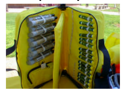
Local jurisdictions need to address protocols for emergency medical practitioners to administer antidotes.

The constraint, however, is that the scope of practice for Emergency Medical Technicians-Basic (EMT-B) and EMT-Paramedics (P) generally does not allow for the administration Departmental, regional, or state governing of antidotes. bodies do not include protocols that address exposure to