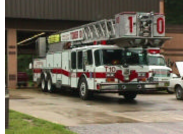
Contamination of response equipment is a concern for all communities. The need exists to continue to provide emergency services regardless of the impact from the event.

Purchase of emergency apparatus can cause a tremendous financial impact on any department. Departments should investigate and be familiar with the procedures necessary for reimbursement once a federal disaster is declared. Other alternatives include emergency assistance programs offered by various dealers and manufacturers.