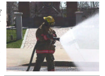
Large volumes of water are necessary to have any effect on removing agent from the skin.

systems. Departments should carefully evaluate the types of systems outlined in the report and evaluate what levels of decontamination they can accomplish based on their resources. Additional equipment may be procured for mass decontamination operations through the federal grant Mass-casualty decontamination must then be incorporated into the department's normal training program.