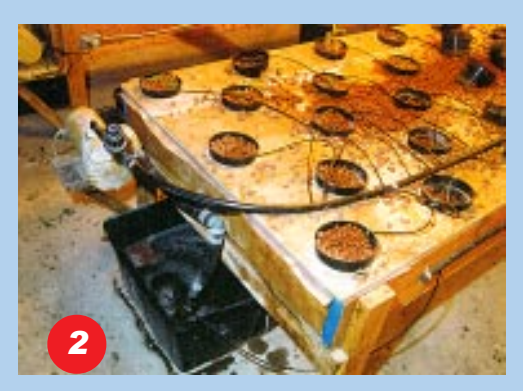
Nutrients are delivered via automated irrigation.