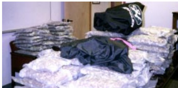
Above, approximately 240 pounds of BC Bud seized from a Canadian military vehicle in August 2000

The U.S. Customs Service (USCS) reported that marijuana seizures along the British Columbia-Washington State land border, which totaled 325 pounds in 1994, increased sharply to more than 2,600 pounds in 1998. Marijuana seizures in the region rose again in 1999, when USCS officials seized nearly 2,900 pounds. Whereas most 1994 seizures took place along the western section of the border at the Blaine and Oroville, Washington, ports-of-entry, recent marijuana seizures have been more widespread.