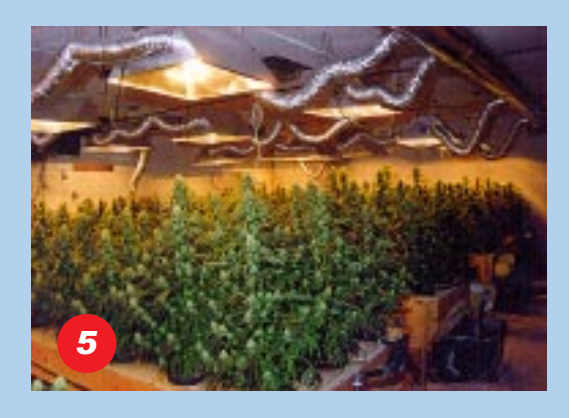
The controlled environment permits year-round cannabis cultivation.