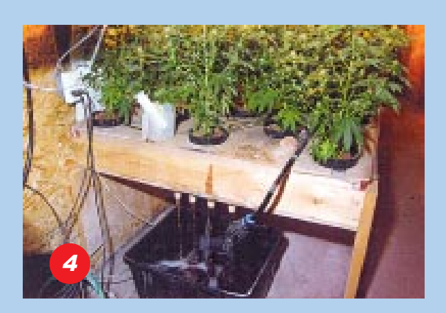
Rates of vegetative growth and maturation are enhanced by special fertilizers, plant hormones, steroids, insecticides, and by manipulation of the light cycle.