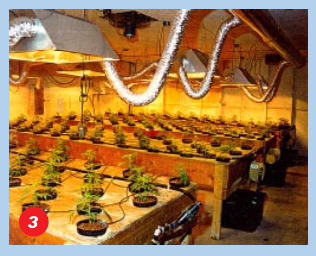
High-intensity lighting and adequate ventilation stimulate rapid growth; some growers provide an atmosphere enriched with carbon dioxide.