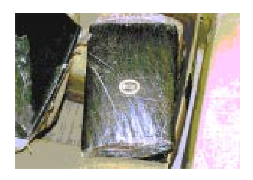
BC Bud seized on March 24, 2000, in Adairsville, Georgia

DEA reporting also notes the trafficking of BC Bud to the eastern United States. For example, on March 22, 2000, approximately 1,100 pounds of BC Bud and $30,000<sup>2</sup> in drug proceeds were seized in