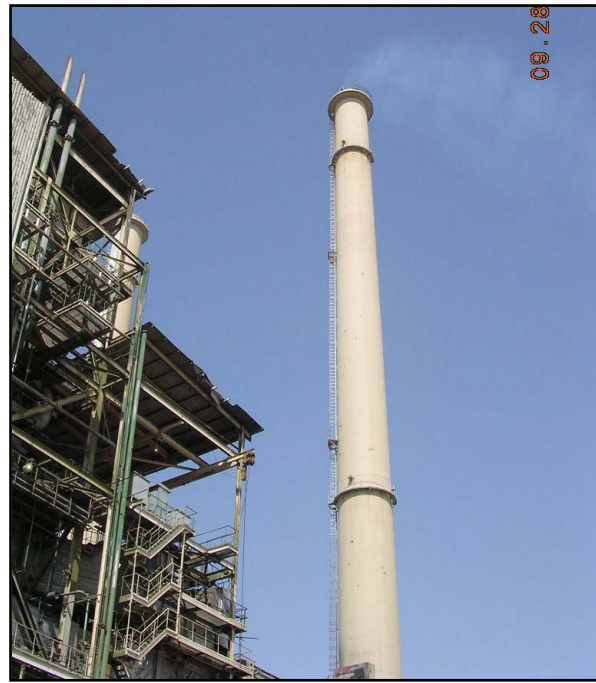
Boiler No. 4 of the Hartha power plant restored to operation