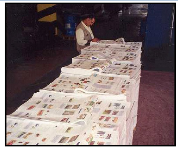
Printing of new revised math and science textbooks.