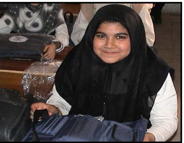
Recipient of USAID school supplies at AI Eman Secondary School.

In an effort to support the MOE to bring students back into Iraq's schools, USAID supported the re-equipping of all 21 Ministry of Education Director General Offices. The offices received new furniture, computers and equipment to support their operations. Director General Offices are located in each of Iraq's governorates with four in Baghdad. The offices are responsible for schools and education programming in each governorate.