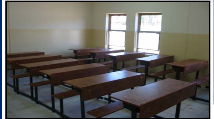
New desks provided by USAID at a rehabilitated secondary school.

Teacher kits: 58,500 teacher kits were delivered to secondary school teachers in November 3003. According to the new MOE statistics of 2003, Iraq has approximately 2,968 primary schools and an estimated enrollment of 1.5 million primary students.