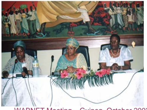
WABNET Meeting – Guinea, October, 2003

ECOTRADE (Common External Tariff) The Gambia, Ghana, Guinea, Nigeria, Sierra Leone, and a representative of WAEMU met in Accra to discuss country-specific progress and the expansion of the Common External Tariff. All countries have made notable progress except Cape Verde. Subsequent to the meeting, Nigeria announced its adoption of the ECOWAS tariff structure.