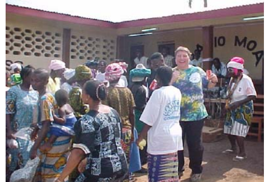
Celebrating the opening of Kailahum Radio Station

The Na Wi Pot (It's Our Pot) consortium of NGOs comprising International Rescue Committee, Center for Victims of Torture, and Search For Common Ground/Talking Drum Studio, inaugurated the community radio station in Kailahun, north-east Sierra Leone on the weekend of 5-7 December, 2003 with a Peace Festival.