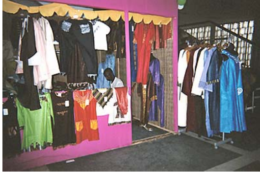
Product show at the WABNET Meeting - Guinea

and implement programs that foster integration in West Africa.