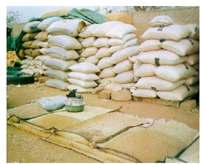
Bags of millet in a Niamey Market-Niger

Based on these forecasts, the Sahel will register gross cereal output that is 25% higher than last year, and 31% higher than the five-year average. Although participants discussed how to avoid a slump in crop prices and to ameliorate the impact on farmers, the region does not yet have a viable plan to address these problems.