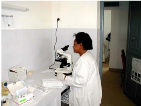
Technician working in a laboratory in Kribi, Cameroon. The lab was renovated through the WARP's Ambassador's HIV/AIDS Fund

Meeting of Regional HIV/AIDS Capacity Building Coordination Group (RHACG) for West & Central Africa: The West Africa Regional HIV/AIDS Capacity Building Coordination Group (RHACG), which is composed of the UNAIDS/Inter-Country Team, USAID/WARP, CERPOD(Centre d'Etudes et de Recherche sur la Population pour le Développement), WAHO(West Africa Health Organization), FHI and JHPIEGO, met for the first time in August 2003 in Dakar. The purpose of the meeting was to explore ways to build and strengthen capacities in HIV/AIDS planning, implementation, monitoring and reporting.