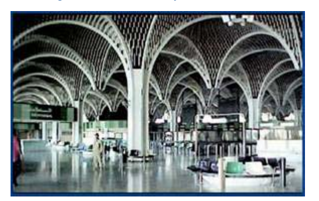
Terminal C at Baghdad International Airport has been refurbished and repaired as part of a $17.5 million project to rebuild Iraqi airports in Baghdad, Basrah and Mosul . The airport has the capacity to handle 7.5 million passengers a day.