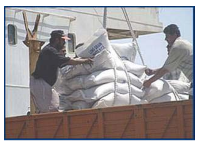
Iraqi workers are unloading humanitarian relief food that will be transported from the port at Umm Qasr, along the rehabilitated section of the railroad.