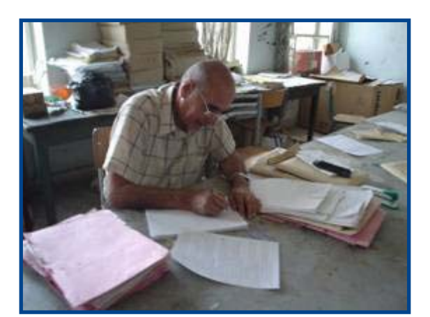
An Iraqi teacher correcting final exams in the Kirkuk school district. USAID assisted UNICEF and the Iraqi Ministry of Education in preparing and administering nationwide end-of-school-year exams, as well as the production of 15 million exam books, enabling children to complete the school year.

On-going support to the Ministry of Education includes consulting on strategic goals, financial management and teacher compensation, as well as school administrator and educator training.