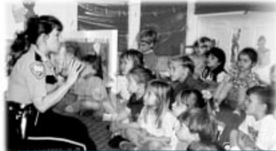
The COPS in Schools initiative provides funding for a sworn officer to be actively involved in primary and secondary schools, working with students to reduce crime and disorder.

Copies of the new brochure on COPS school safety programs are available through the COPS Communications Office at 202-616-1728 or at the COPS website www.usdoj.gov/cops . ■