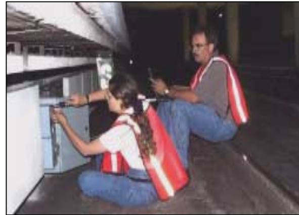
Sensor Installation in Subway