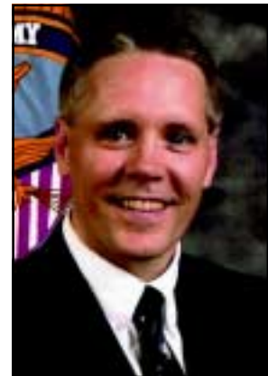
Chief Wuestewald heads the Broken Arrow, Oklahoma, Police Department.

Of all the differences between my day and theirs, technology represents the greatest contrast and the supreme challenge. Consider this: when I began my career as an officer, technology was a 1977 Plymouth Fury with a 400-cubic inch, 4 bbl V-8, an old hickory nightstick, and a .357 revolver. Now, compare that with the fact that these officers will drive a police car with more sophisticated electronics than the first Apollo moon shot—cars fully equipped with state-of-the-art mobile data computers, digital video cameras, and 800 megahertz radios. They will wear lightweight ballistic vests made of space-age material that provide incredible new levels of protection. They will carry high-capacity, .40-caliber semiautomatic pistols, pepper spray, and electronic impulse Tasers capable of stopping even the meanest and most determined attacker. They will have access to infrared and thermal-imaging devices to help them see into the darkness. They will use lasers to catch speeding