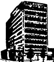
Carnegie International Center — New York