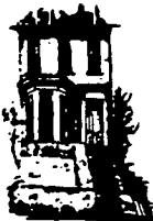
Legislative Office Washington, D. C.