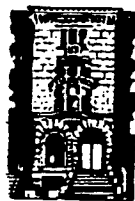
Jane Addams House Philadelphia, Pa.