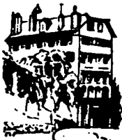
International Office Geneva, Switzerland

National Headquarters, 2006 Walnut St., Phila. 3, Pa.