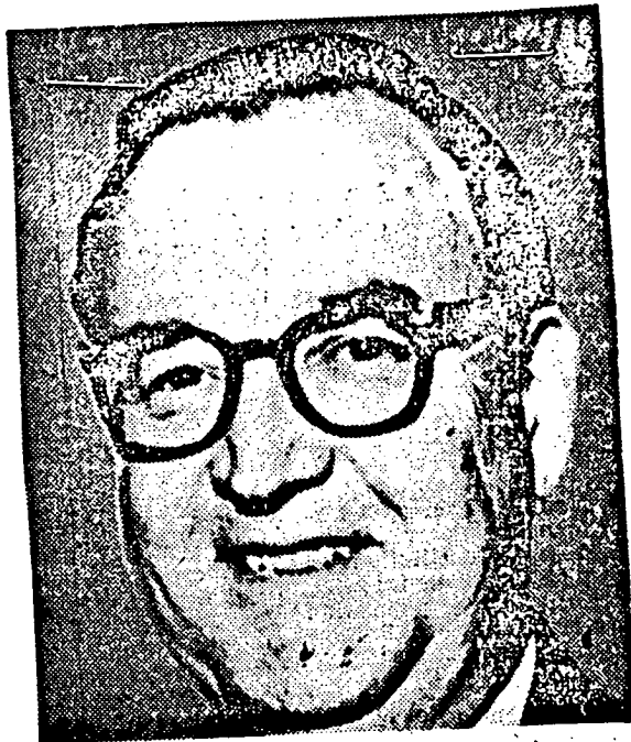
Edmund G. Brown

I am positive that out of this crisis will come an even greater University of California—a university ready for the 21st century. A university ready in structure, ready in freedom, ready in respect for law, and more worthy worthy than ever of the prestige which is the University of California.