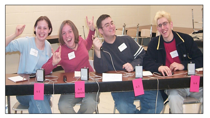
Students from Kalamazoo High School participate in the annual Midwest Regional Competition of the National Ocean Sciences Bowl.

In addition to distributing paper copies of GLERL's publications, the Publications Unit produces electronic copies and makes them available on GLERL's web page. This has proved to be an excellent avenue for dissemination of GLERL's products.