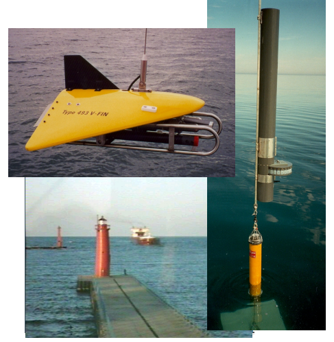
The Plankton Survey System (top), the Sequential Sediment Sampler (right), and image from GLERL's Muskegon web cam (bottom).