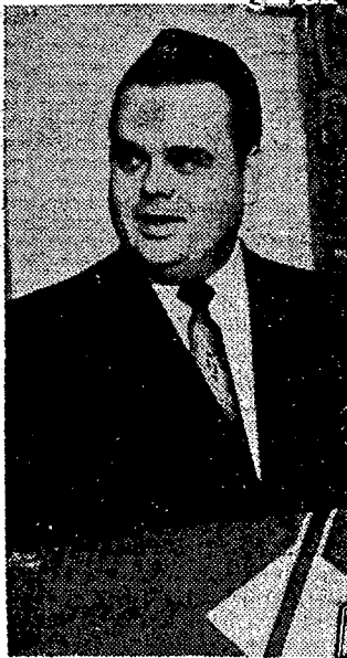
BILLY JAMES HARGIS

The meeting is expected to attract about 200 members of the organization.