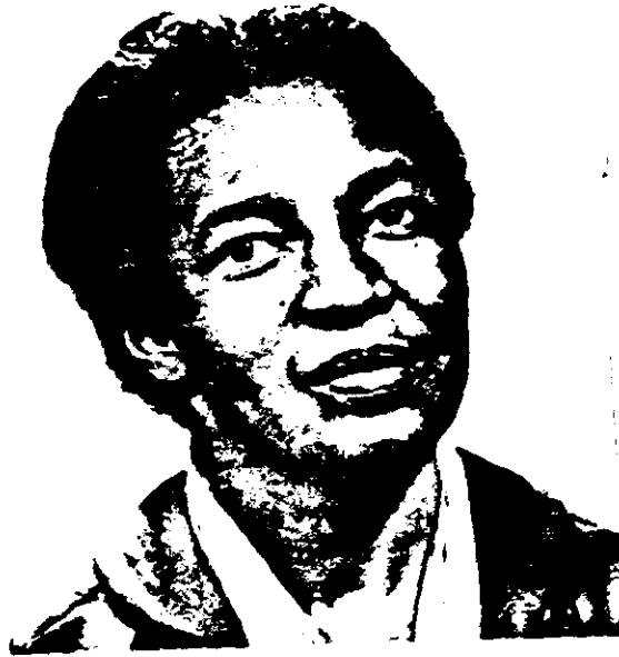
COMRADE CLAUDIA JONES Alternate Member, National Committee, C.P.U.S.A. Recently released Smith Act prisoner. McCarran-Walter Act Deportee

Fraternal salutations and best wishes, Comrade Claudia!