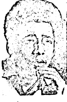
Smiling, prayerful, talkative, pensive George Jackson in prison photos