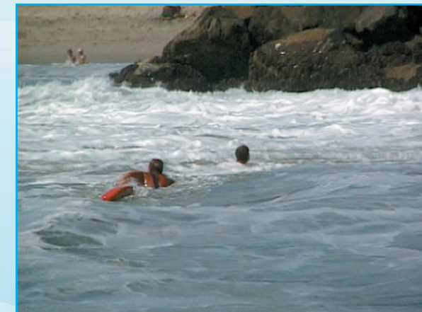
A lifeguard rescues a swimmer caught in a rip current.