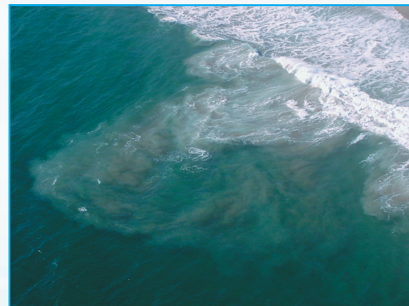
Rip currents often generate a plume of sediment moving away from shore.