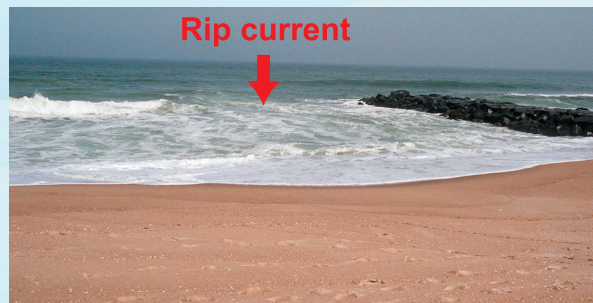
Rip currents often form near coastal structures.