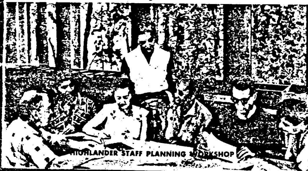
HIGHLANDER STAFF PLANNING WORKSHOP