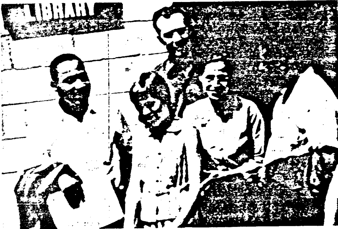
ROSA PARKS, MARTIN LUTHER KING AND REVEREND ABERNATHY:

SWIMMING BOTH THE DAY AND NIGHT grated in all respects.