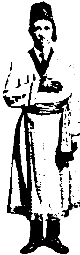
NOBLE DREW ALI Founder

ACT 4.—All members must preserve these Holy and Divine laws, and all members must obey the laws of the government, because by being a Moorish American you are a part and partial of the government, and must live the life accordingly.