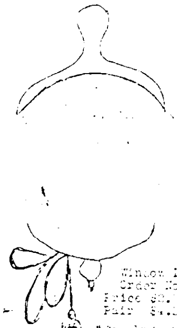
Window Light. Order No. 50 13 Price $2.50 ea. Pair $4.50.