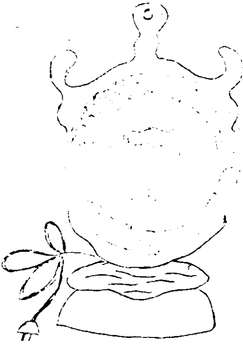
Table Lamp Order No. 50 14. Price $3.80