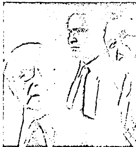
Beame and Flynn: A matter of psychology?