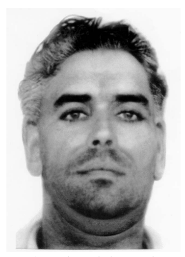
Photograph taken in 1991