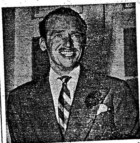
Douglas Fairbanks, Jr.—photographed as he left the White House yesterday—will leave April 20 on a two-month good will tour of Latin America for FDR. He will make 10 speeches—in English, French and Spanish.

The bulk of the work naturally is being done in the departments where fairly ex-