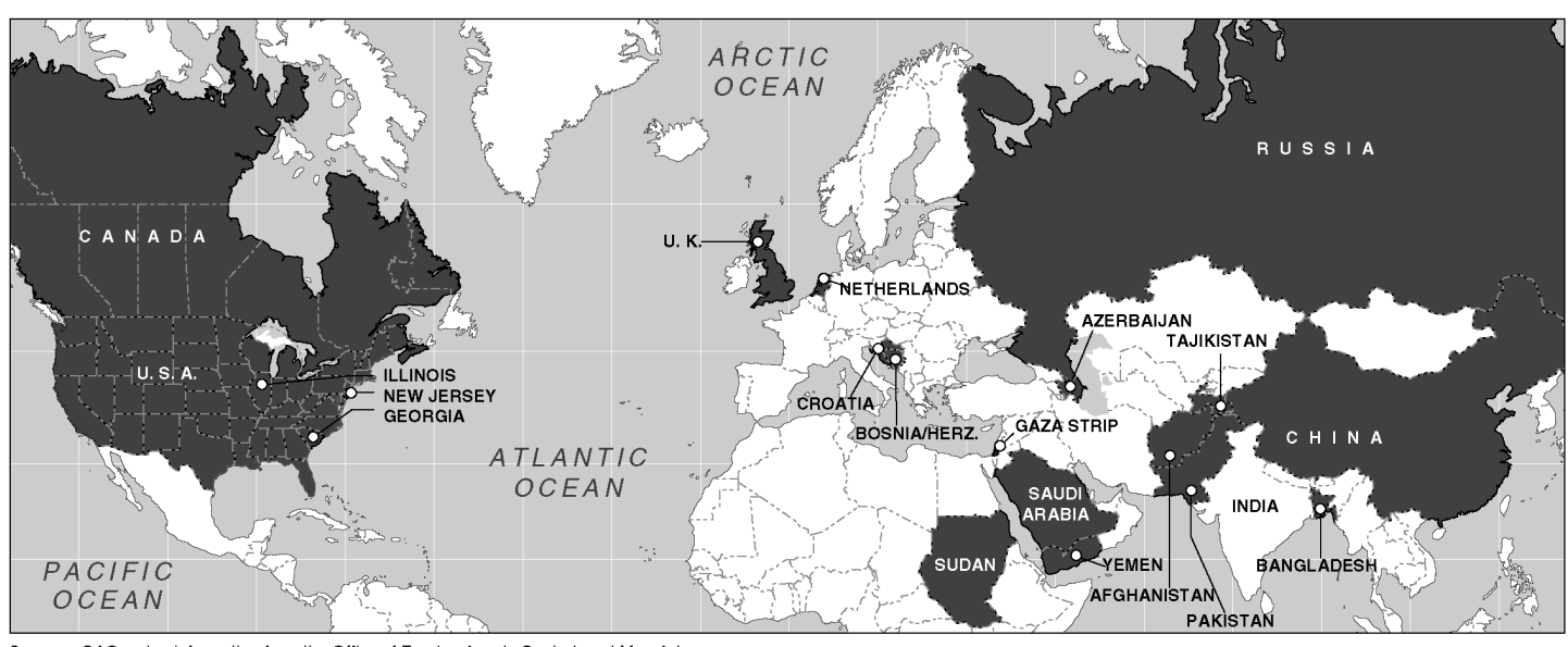
Figure 2: Location of Benevolence International Foundation Offices Worldwide