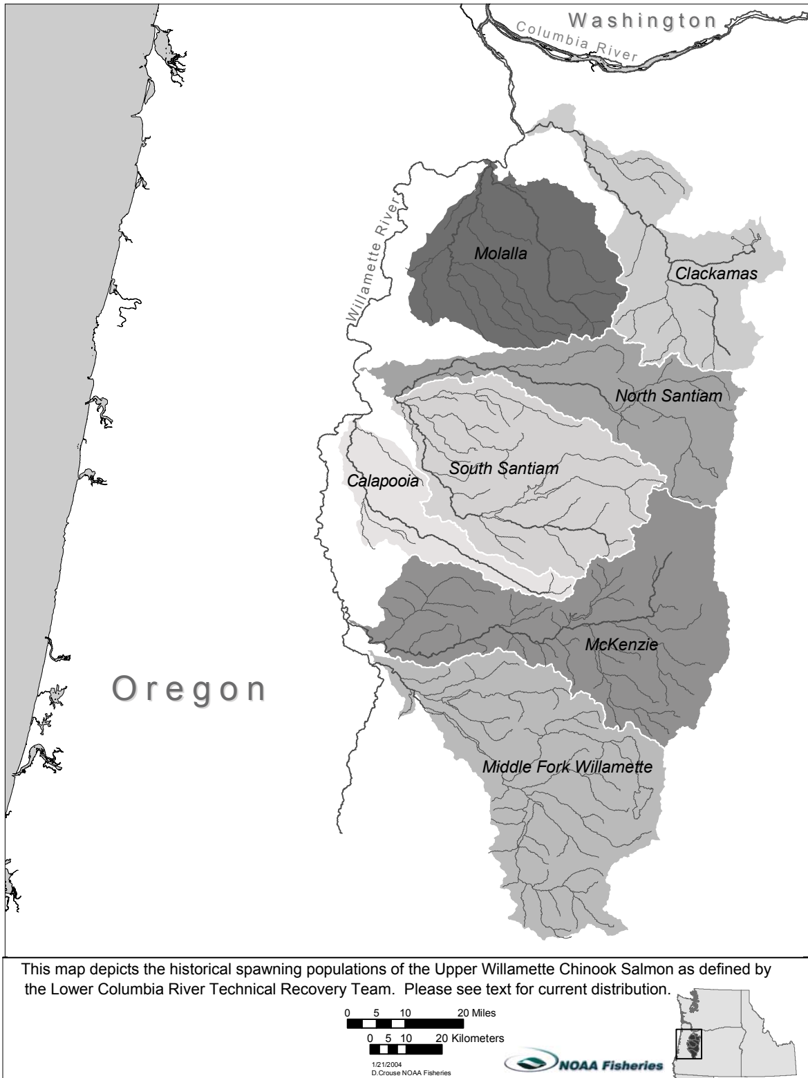
Figure B-4. Historical spawning populations of the Upper Willamette River Chinook Salmon.