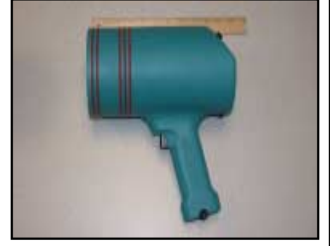
2nd Generation JAYCOR Handheld Acoustic Weapons Detector