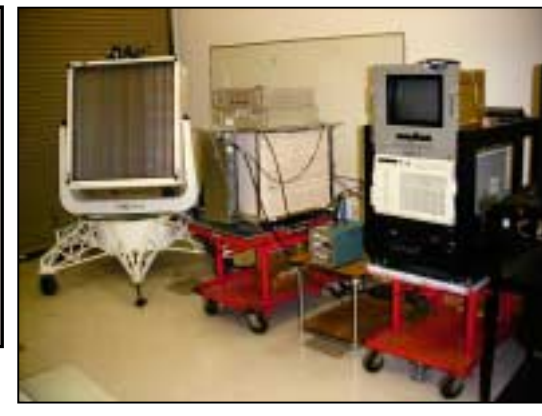
Trex Remote Weapons Detection System, demonstrated to NLECTC - NE RAC, Oct. 00