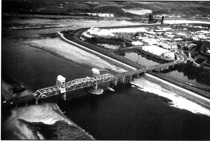
Confluence of the Snake and Clearwater Rivers, during the March, 1992, reservoir drawdown test.