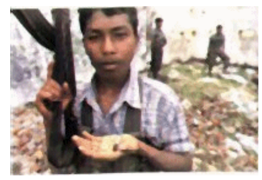
A LTTE child soldier with a cyanide capsule in his hand.

and carry around their necks a glass vial containing potassium cyanide. Suicide is common in Hindu society, and the Tigers are fanatical Hindus. The cyanide capsule, which LTTE members view as the ultimate symbol of bravery and commitment to a cause, is issued at the final initiation ceremony. A LTTE commando who wears the capsule must use it without fail in the event of an unsuccessful mission, or face some more painful form of death at the hands of the LTTE. One of the first reported instances when LTTE members had to