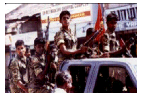
LTTE child soldiers

The majority of the rank and file membership belong to the lower middle class. Almost all LTTE cadres have been recruited from the lower-caste strata of Jaffna society. The Tamil Tigers draw their recruits from the Tamils who live in the northern province and some from the eastern province. The cadres drawn from other