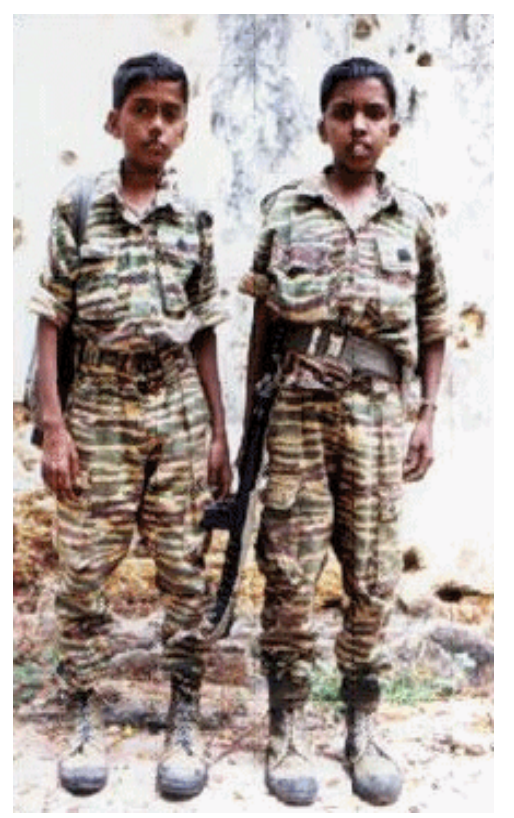
LTTE child combatants

Among the world's child combatants, children feature most prominently in the LTTE, whose fiercest fighting force, the Leopard Brigade (Sirasu puli), is made up of children. In 1983 the LTTE established a training base in the state of Pondicherry in India for recruits under 16, but only one group of children was trained. By early 1984, the nucleus of the LTTE Baby Brigade (Bakuts) was formed. The LTTE trained its first group of women in 1985. In October 1987, the LTTE stepped up its recruitment of women and children and began integrating its child warriors