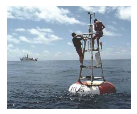
Routine instrument maintenance is performed