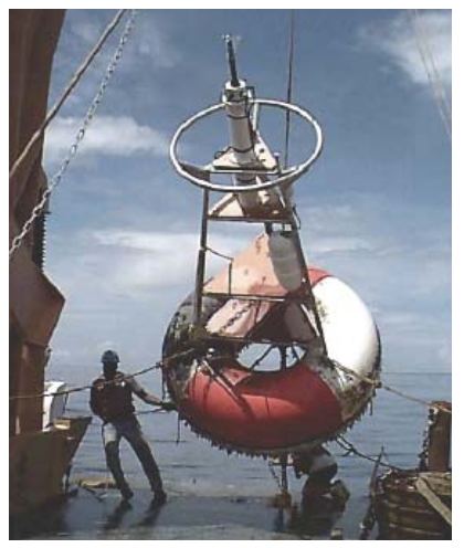
TAO buoy is brought aboard for cleaning and maintenance

Commissioned: April 25, 1996 Builder: Halter Marine, Inc. Moss Point, Mississippi