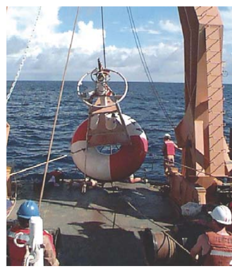
A newly serviced TAO buoy is deployed

In January 2000, the ship provided support to the Sustainable Seas Expedition's exploration of NOAA's Hawaiian Island Humpback National Marine Sanctuary.