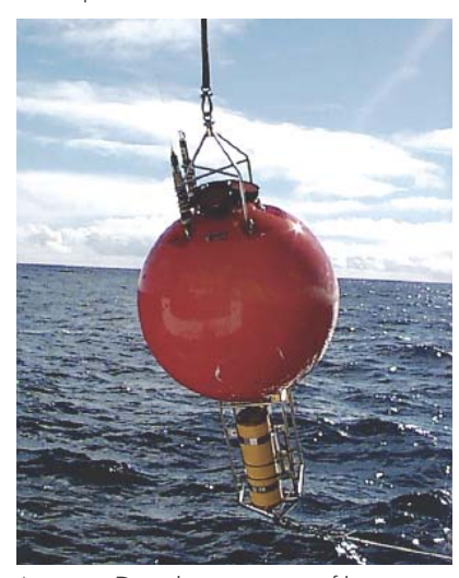
Acoustic Doppler current profiler is deployed to measure ocean currents

Ka'imimoana, Hawaiian for Ocean Seeker, is a converted U.S. Navy T-AGOS class vessel. The ship supports NOAA's oceanographic and climatic research in the equatorial Pacific Ocean. The ship is dedicated to implementing and maintaining NOAA's Office of Oceanic and Atmospheric Research, Pacific Marine Environmental Laboratory's Tropical-Ocean-Atmosphere (TAO) Project. The TAO project plays a critical role in improving our understanding of the role of the tropical ocean in modifying world climate and El Niño/La Niña prediction. Ka'imimoana's primary mission is to deploy, recover, and service deep-sea moorings that measure ocean currents and temperatures and atmospheric conditions throughout the equatorial regions of the Pacific Ocean. The ship replaces and repairs approximately 14 deep sea moorings per cruise.