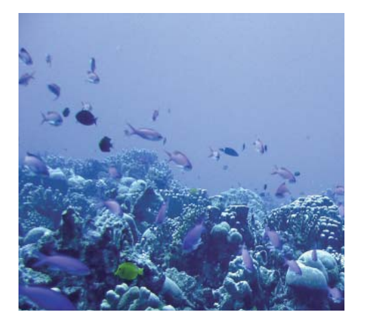
Coral reef ecosystem found off the island of Saipan, Commonwealth of the Northern Marianas Islands (CNMI).

HI'IALAKAI's multibeam equipment is being used to continue the coral reef mapping activities that were initiated in 2002 by the U.S. Coral Reef Task Force. One of the primary goals is to develop a suitable baseline map of the working areas so that periodic monitoring will enable scientists to determine whether or not the reef systems are growing or shrinking over time. The coral reef ecosystems are especially important because they support several endemic, threatened, and endangered marine mammals, fish, sea turtles, and birds.