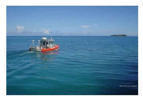
NOAA's multi-beam survey launch, R/V AHI, getting underway to conduct benthic habitat mapping.