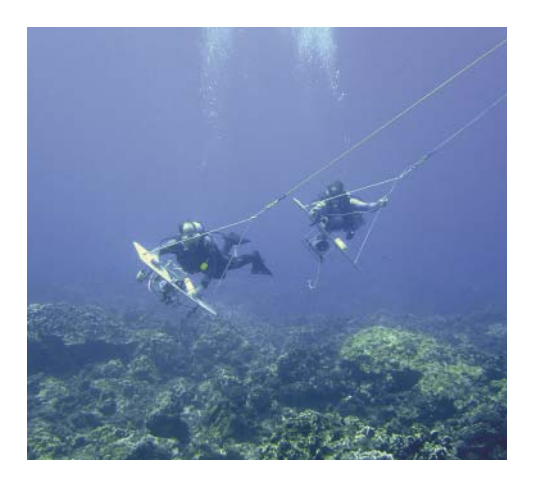
Tow-team divers collect video documentation of benthic habitat.