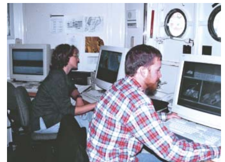
Survey technicians processing bathymetric data collected by the launches and ship