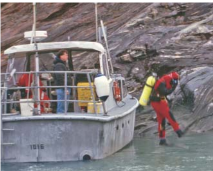
Diver assists with the installation of a tide gauge in Tracy Arm, Alaska