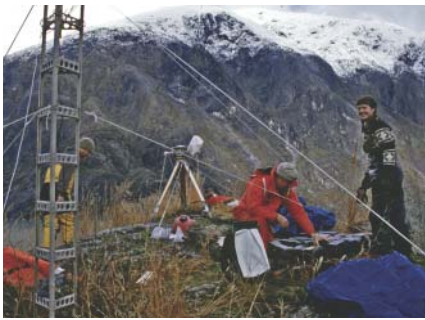
Shore party establishes a Differential GPS station in Yakutat Bay, Alaska

Length (LOA): 231 ft. Breadth: 42 ft. Draft: 15.5 ft. Hull: Welded steel/Ice strengthened Displacement: 1,800 tons Gross tonnage: 1,591 tons Cruising Speed: 12 knots Range: 6,000 nm Endurance: 22 days Hull Number: S 220 Call Letters: WTEB Commissioned Officers: 8 Licensed Engineers: 4 Crew: 23 Scientists: 23 Launched: March 1967 Delivered: January 1968 Commissioned: October 1968 Builder: Aerojet-General Shipyards, Jacksonville, Florida Designer: Maritime Administration