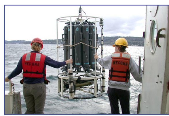
Deploying a CTD during a research cruise

Living marine resources in the Pacific Northwest use and depend on a variety of ecosystems from freshwater streams and rivers to estuaries and the ocean. Center scientists conduct research to better understand how natural environmental fluctuations impact living marine resource productivity, how human-caused stress affects ecosystems and living marine resources, and the complex interactions between living marine resources and their habitats.