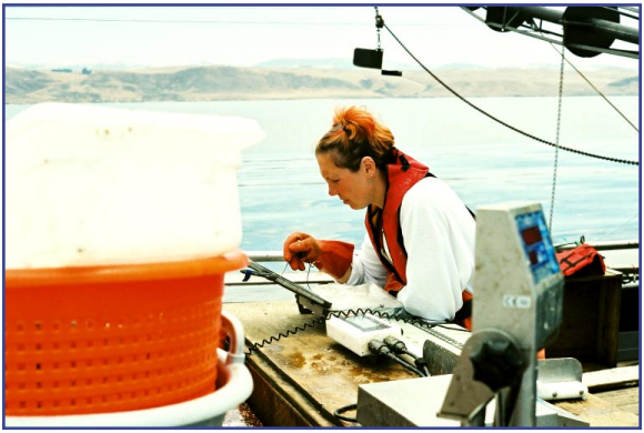
Entering data with the new on-board data collection system

The Center implemented a new on-board data collection system that relies on a small wireless network. This network connects a "ruggedized" touchscreen computer to electronic measuring equipment for outdoor data collection. Additionally, the system connects to an indoor network to maintain continuity with trawl operations and to provide data back-up and follow-on processing. This system has improved the data collection process.