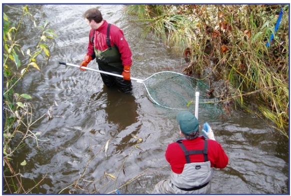
Surveying a Washington urban stream

issue for endangered and threatened populations. To further investigate this issue, the Center, in collaboration with local agencies, conducted a series of studies in fall/winter 2002. Through weeks of intense fieldwork, scientists documented a very high rate of acute mortality (>90%) in adult coho salmon returning to spawn in urban streams. Before they died, these adult coho showed a common suite of symptoms (e.g., loss of orientation and equilibrium). Although we do not know the cause of this mortality, poor water quality is a leading hypothesis. Expanded field surveys in fall/winter 2003 will further investigate the cause(s) of this mortality.