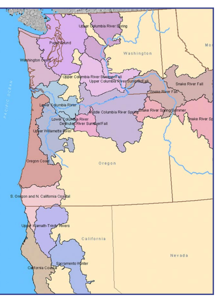
26 listed West Coast salmon and steelhead ESUs

updated the status reviews of all 26 currently listed salmon and steelhead ESUs, as well as one candidate species population. In their assessments, scientists considered new data that had accumulated since the last reviews in the mid-to-late 1990s and addressed issues raised in recent court cases regarding the consideration of hatchery fish and resident fish populations in listing determinations. This was a huge undertaking. Scientists compiled and updated abundance, productivity, diversity, and spatial structure data for each ESU. The analyses and resulting report will provide the scientific basis NOAA Fisheries needs to recommend any changes to the ESA listing status of West Coast salmon and steelhead populations.