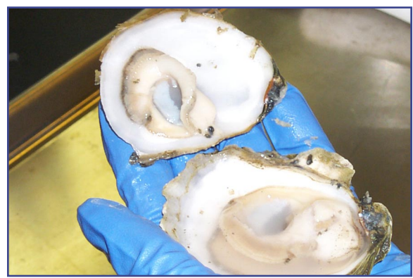
Analyzing oysters for presence of experimentally introduced Vibrio vulnificus

Captive broodstock programs play an important role in species conservation for seriously depleted populations, such as Redfish Lake sockeye salmon. These programs are challenging, however, because the salmon that are produced must be healthy and capable of surviving and reproducing in the wild. Center scientists, in collaboration with the University of Maryland, advanced spawning time of Redfish Lake sockeye salmon captive broodstock with implants of gonadotropinreleasing hormone, a drug commonly used to treat infertility in humans. The hormone has improved survival of offspring and will significantly improve the production of juvenile fish from captive broodstock programs for recovery of depleted Pacific salmon stocks.