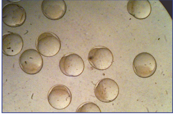
Pacific cod eggs

Puget Sound Pacific cod stocks have been severely depleted for decades and have not recovered despite years of minimal fishing pressure. Center scientists, in cooperation with Washington Department of Fish and Wildlife scientists, successfully captured, spawned, and reared Puget Sound Pacific cod larvae for the first time. This research will help determine if Pacific cod stocks that traditionally spawned in Puget Sound differ genetically from the larger Pacific cod stocks and whether cultured juveniles could be used to rebuild Pacific cod stocks in Puget Sound.