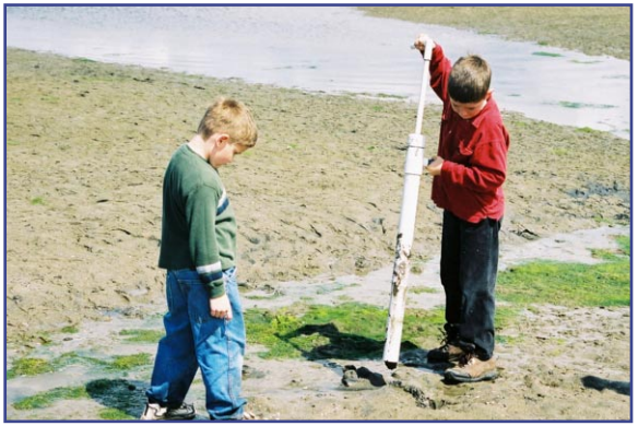
Children participating in a SeaFest activity

The Center signed an agreement with Washington State University to support cooperative research opportunities that will advance salmon recovery efforts in the interior Columbia River Basin. The Center also partnered with the Pacific States Marine Fisheries Commission, Pacific Fishery Management Council, and the Pacific Marine Conservation Council to create a new cooperative research website.