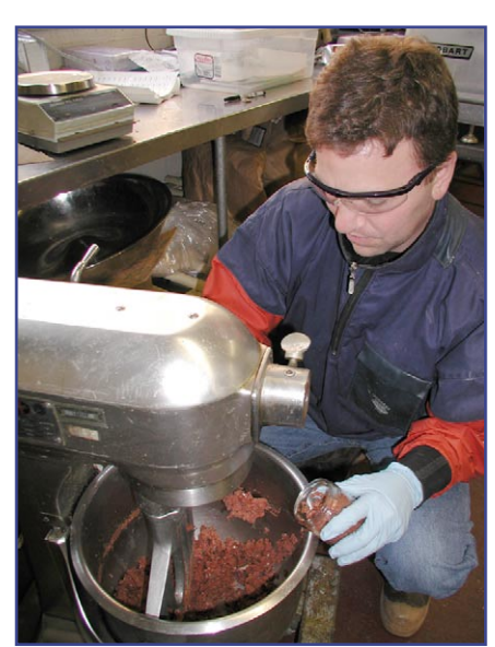
Preparing killer whale prey samples for contaminant & nutrition analysis