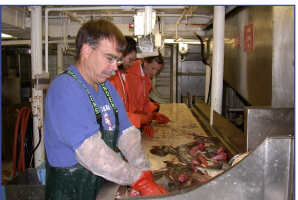
Sorting fish collected during a groundfish survey

The Center leads the West Coast Groundfish Observer Program. As part of this program, observers are placed on commercial fishing vessels to monitor and record groundfish catch data and collect critical biological data. In January, the Program released a summary and analysis of its first year of trawl fleet observations. This is the first comprehensive coast-wide information on bycatch and discard for West Coast groundfish.