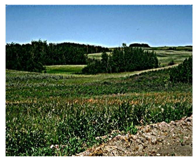
Without fire, woody plants have spread, including aspen trees, usually surrounding wetlands, changing Lostwood Refuge from a herbaceous grassland to aspen parkland.

The importance of this alternative is unclear until one studies how the whole grassland system functions together. To provide high-quality habitat for maintenance and production of grassland migratory birds and other wildlife, upland vegetation must be in a healthy and vigorous state. This is accomplished through periodic disturbance involving partial or total defoliation of the vegetation, simulating two historical events, short, intensive grazing by native herbivores and wildfires. These defoliation events reduce buildup of residual vegetation, and thus increase energy flow, water, and nutrient cycling (Vogl 1974; Wright and Bailey 1982, Bragg 1995, Bragg and Steuter 1996).