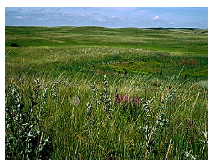
Over every hill lies another wetland or prairie meadow. In between, from hilltop to slough edge, sprawls a most splendid variety of prairie plants.