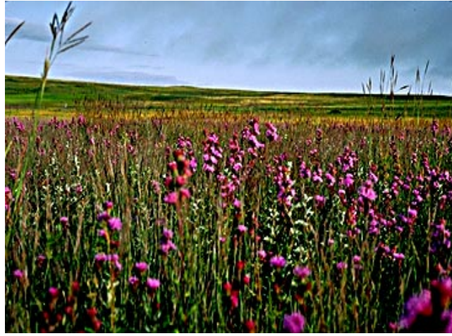
Lostwood Refuge's plant diversity on moist soil sites includes components of the tallgrass prairie.

The climate at Lostwood Refuge is semiarid with normal temperature extremes of -40°F in winter and 100°F in summer. Mean annual precipitation is 16.6 inches, with extremes of 9 to 29 inches. Some winters have almost no snow, while others are severe with snowstorms from October through May. May and June are normally the wettest months, while July and August present violent thunderstorms often accompanied with several inches of rain or hail. Winds ranging from 5-20 mph are prevalent through most seasons, and 30-40 mph winds are common, particularly in spring and fall. All wetlands, except major lakes, may be completely full one year and completely dry 5-10 years later. These extreme conditions create a "boom and bust" scenario for the production of water-dependent species such as ducks. This wetto dry-cycle also prevents frequent disease outbreaks (i.e., botulism) and provides for maximum wetland fertility, and thus high water bird productivity, in wet years (Kantrud et al. 1989). The growing season varies from 90 to 100 days.