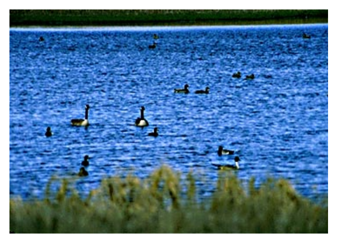
Twelve different species of waterfowl nest on Lostwood Refuge.

As reviewed above, the whole grassland system was kept active and healthy by periodic grazing, fire impact, and rest; without these treatments, native plants decline and changes in the plant community occur. Without these three treatments, nonnative plants to the Lostwood area such as smooth brome, Kentucky bluegrass, quack grass, and leafy spurge, were competitively favored and increased. Returning fire and simulating bison using livestock in shorter durations will return indigenous flora and fauna but will take 10-20 years of intensive management to see the long-term results.