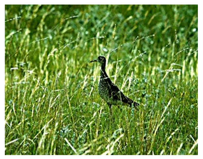
Finding an upland sandpiper on a flowering xeric knoll, with Baird's sparrows and Sprague's pipits singing and skylarking around you, butterflies flittering about, and waterfowl slapping the water with their bills as they feed in a nearby wetland, conveys a species richness of not only plants, vertebrates and invertebrates, but also a place of unique beauty, a place that contributes to the richness of the natural world.

Because of Lostwood Refuge's location in the Prairie Pothole Region, it is an integral part of a broad coalition of public and private programs that cooperate on international, national, and regional bases to restore and protect wildlife habitat. The Prairie Pothole Region of the U.S. and Canada is North America's premier waterfowl breeding habitat area and the highest priority