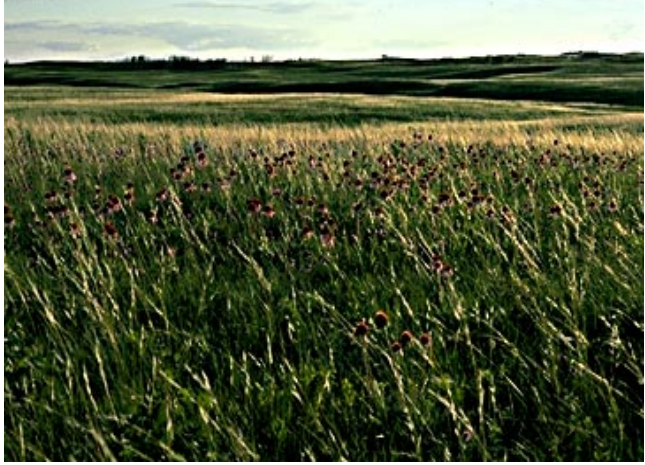
Lostwood Refuge's plant diversity on dry soil sites includes components of the mixed-grass prairie and short-grass of the more arid west.

The last free-ranging bison in North Dakota occurred in the early 1880's (Hornaday 1889; Grinell 1970; Joyce and Skold 1988). The last raging wildfires occurred in the early 1900's as persons of European descent homesteaded on the Missouri Coteau of northwestern North Dakota in the early 1900's, where Lostwood Refuge is located (reviewed by Murphy 1993). Before settlement, early explorers conveyed that no trees or shrubs were anywhere (reviewed by Murphy 1993). However, suckers and saplings of quaking aspen apparently were scattered over the prairie, but were dwarfed by frequent fire and herbivore grazing. Although no trees existed on Lostwood Refuge before settlement (except for an elm grove along a Refuge lake), by 1938, aspen tree clumps totaled 275 and covered 100 acres; by 1969, 500 clumps totaling 375 acres; and in 1985, 540 clumps (475 acres), or about 13 clumps/mi<sup>2</sup> (Murphy 1993). The spread has