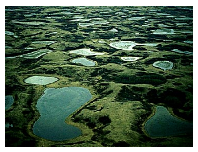
Aerial view of Lostwood National Wildlife Refuge's wetland complexes, one of several prominent resources that makes this Refuge so unique and valuable.

future of Lostwood National Wildlife Refuge (Lostwood Refuge). With narration and a few pictures, I present a glimpse of a year on this unique resource so the reader can "experience" the four seasons on Lostwood.