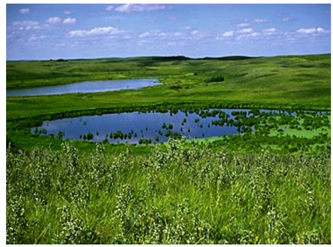
Lush prairie wetlands help create the unique diversity of habitat on Lostwood Refuge that makes the area so attractive to a variety of breeding migratory birds.

Lostwood Refuge is "... a refuge and breeding ground for migratory birds and other wildlife ..." (Executive Order 7171-A, September 4, 1935). Located in northwestern North Dakota, it is primarily a breeding ground for migratory birds during spring and summer.