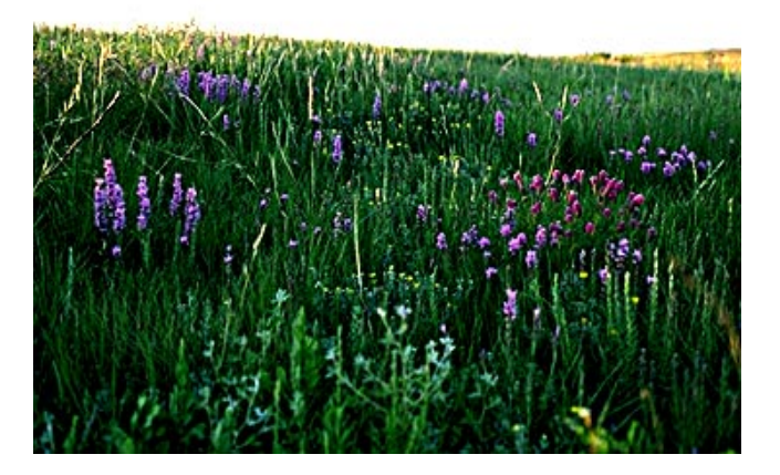
Nutrient cycles are triggered with fire, and plants respond by producing rich, succelent growth, as shown here in a xeric hill site in late July after a mid-May burn.

Heavy layers of litter and excessive humus creates a micro environment that is attractive to exotic grass species (Ode et al. 1980). Fire removes litter and reduces humus, producing a more arid soil environment (Bragg and Steuter 1996), a condition unattractive to these exotic species but attractive to most native herbaceous species (Bragg 1995). Removing excessive litter with a prescribed burn under predetermined conditions, decreases the risk of destructive wildfires (Bailey 1988). Fire prevents grasslands from succeeding to shrubland (Sauer 1950). It can also reduce dominance of mosses (Bragg 1995), a desired fire effect on club moss, an allopathic (prevents other plants from establishing) species in the northern Great Plains. Fire can maintain or change a physical vegetation structure to provide desired habitat for indigenous wildlife (Bailey 1988). Fire usually increases species diversity (Anderson and Bailey 1980, Bragg and Steuter 1996), including wetlands (Bailey 1988). Fire produces conditions for native seedling establishment for long-term plant diversity, particularly forbs (Bragg and Steuter 1996).