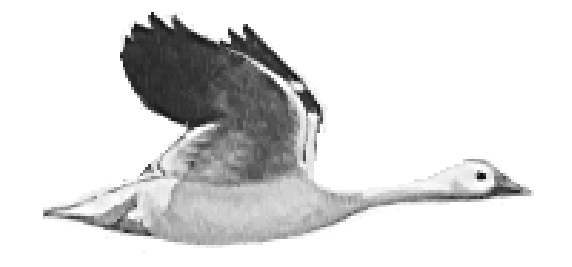
Snow goose