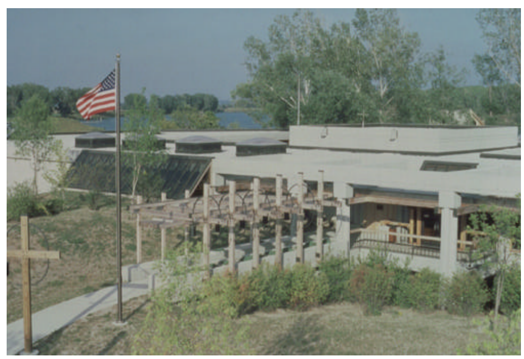
DeSoto National Wildlife Refuge Visitor Center

Available in alternative formats upon request.