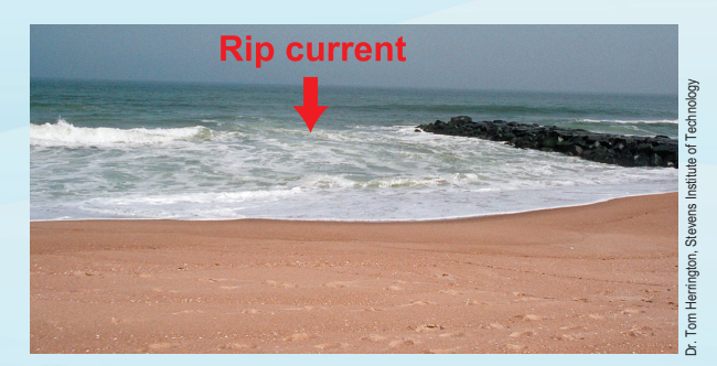
Rip currents often form near coastal structures.