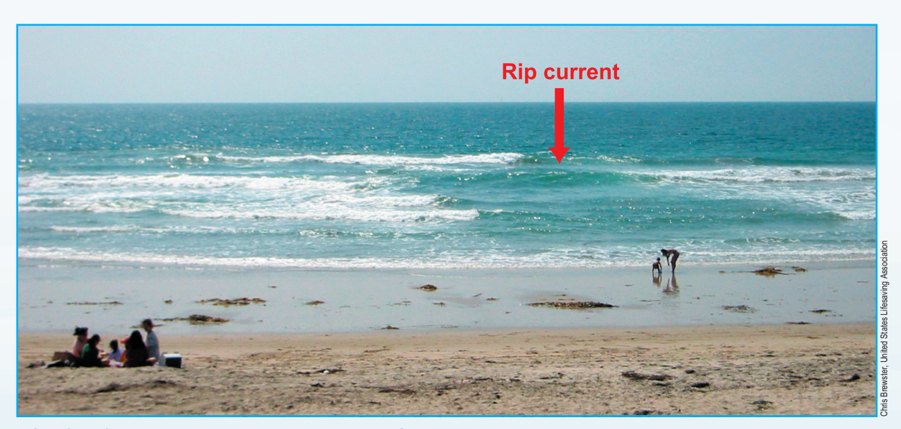
A break in the incoming wave pattern is one sign of a rip current.