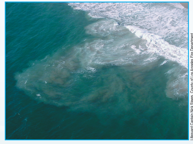
Rip currents often generate a plume of sediment moving away from shore.