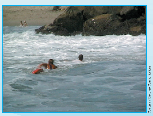
A lifeguard rescues a swimmer caught in a rip current.

IP CURRENTS BREAK THE GRIP OF THE RIP RIP CURRENTS BREAK THE GRIP OF THE RIP RIP CURRENTS BREAK THE GRIP OF THE