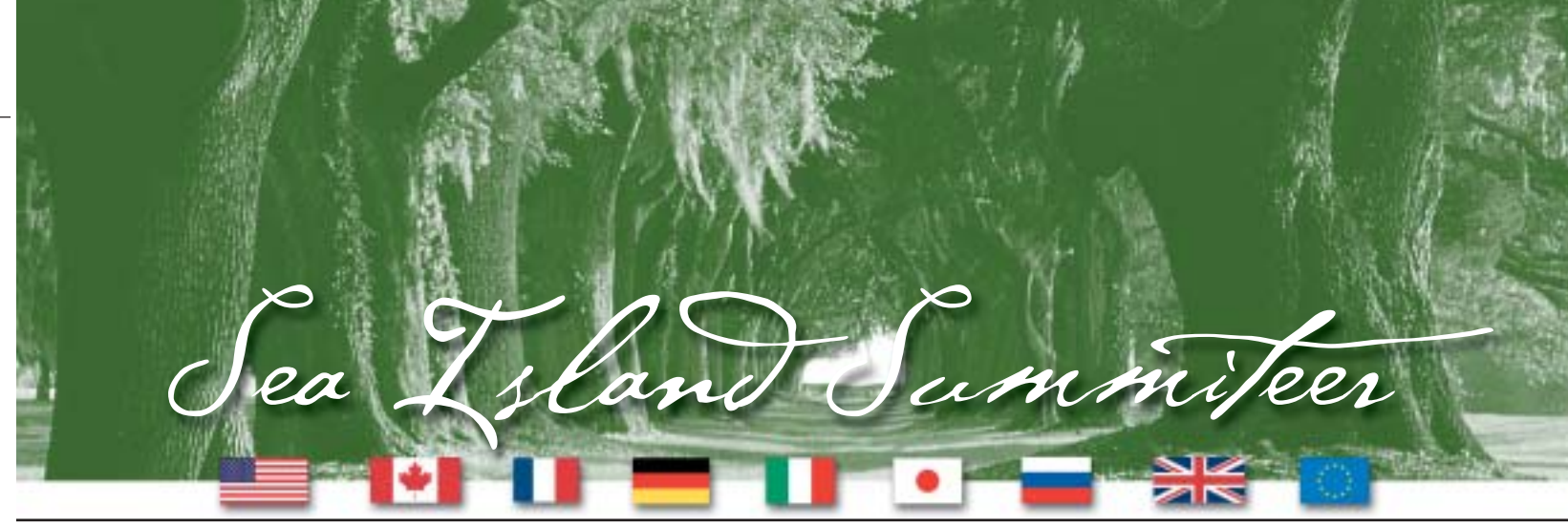
The Official Newsletter of the 2004 G8 Summit Planning Organization

This newsletter is printed on environmentally friendly paper, using vegetable based inks.